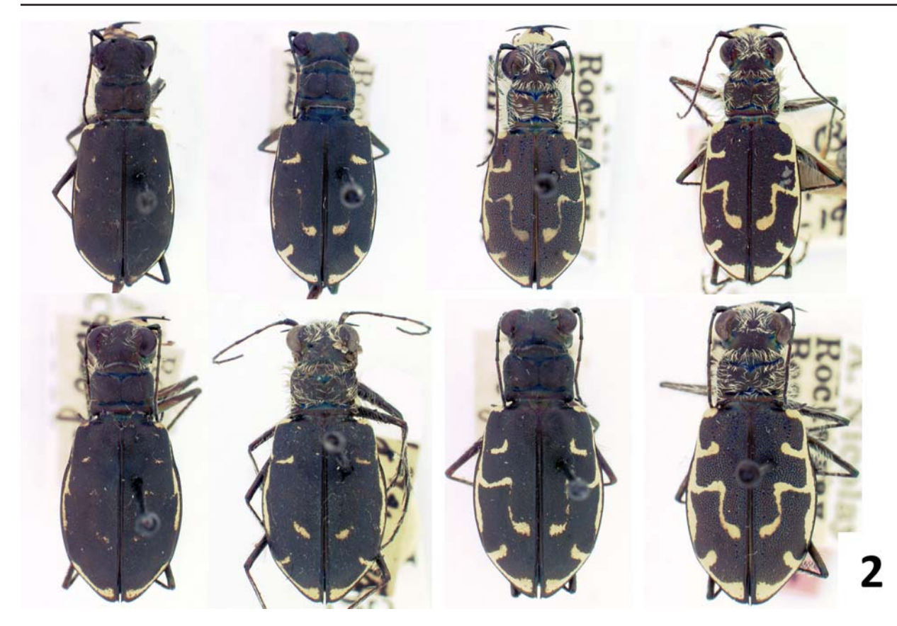
Figure 2 . Adult specimens of Cicindela hirticollis Say collected at Rockaway Beach on Long Island between 1909 and 1932, showing variability in elytral color pattern ranging from the form described as C. h. hirticollis Say (right) to the form described as C. h. rhodensis Calder (left). Specimens in top row are males; specimens in bottom row are females.

deliberately chose to survey stretches of the larger beaches that showed the fewest signs of human disturbance.