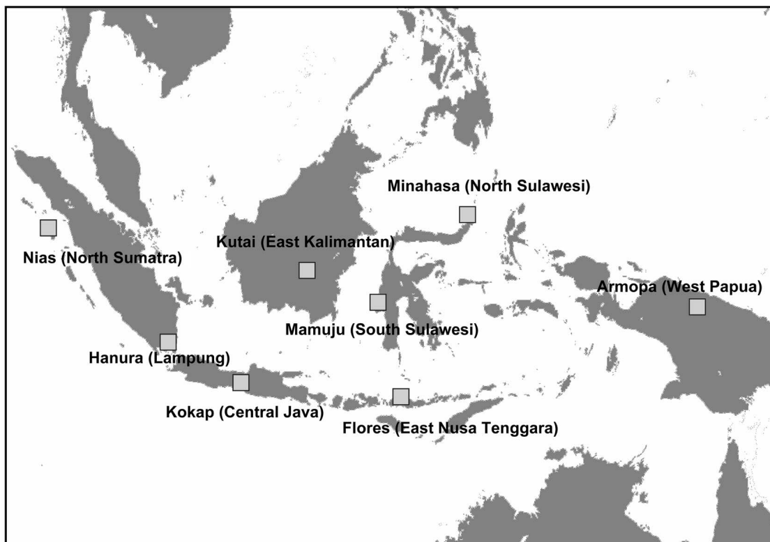
FIGURE 1. Map of the Indonesian archipelago and the sampling sites (boxes) of the isolates of Plasmodium falciparum .

a life-saving antimalarial drug in severe and complicated malaria. This study was carried out with the approval of the Ethics Committees for Protection of Human Subjects at the Eijkman Institute for Molecular Biology (Jakarta, Indonesia) and The Walter and Eliza Hall Institute (Melbourne, Victoria, Australia).