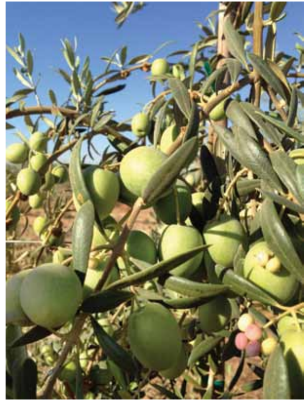
Fully mature olives growing in a California orchard. The state's 2012 olive harvest of 320 million pounds was worth about $130 million.

The ability of olive extracts to kill foodborne pathogens has been reported in earlier studies conducted at Albany, Tucson, and elsewhere. However, the E. coli and amines study, reported in a 2012 issue of the Journal of Agricultural and Food Chemistry , may be the first to show olive powder's performance in concurrently suppressing three targets