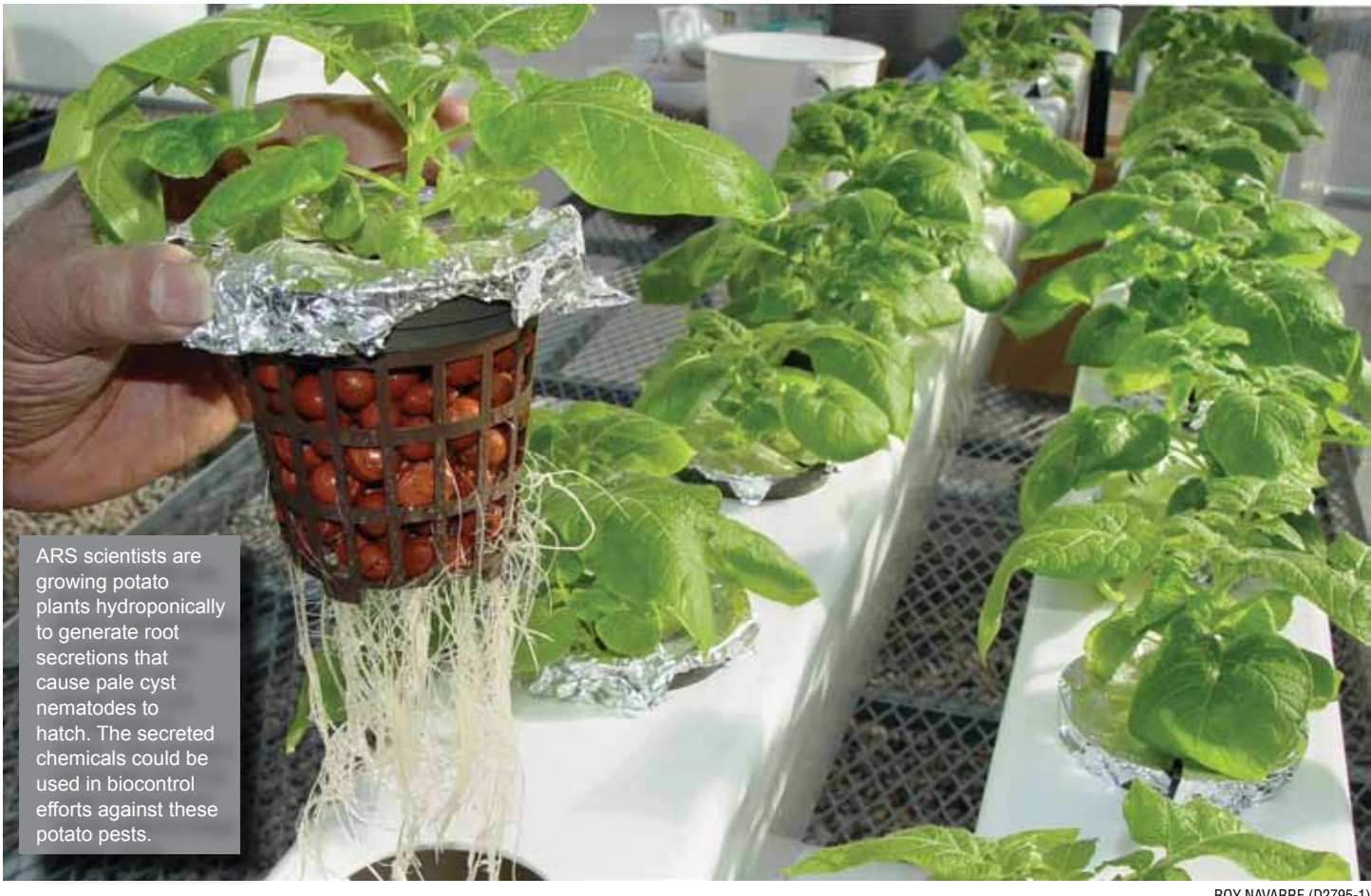
ROY NAVARRE (D2795-1)

G. pallida , a nonnative species, was first detected in eastern Idaho in April 2006. To