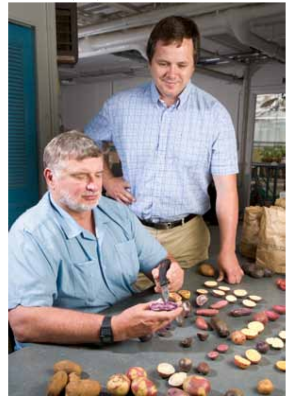
STEPHEN AUSMUS (D857-1)

date, the species has been found in—and confined to—a 5-mile radius comprising 1,916 total acres in Bingham and Bonneville counties.