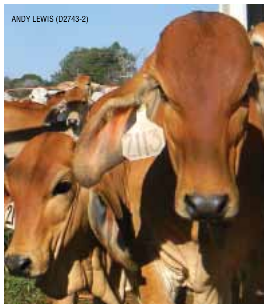
Brahman calves just before transport to Lubbock, Texas. Each calf’s stress response will be monitored before, during, and after transport to determine whether temperament is linked to the amount of stress experienced in transport.