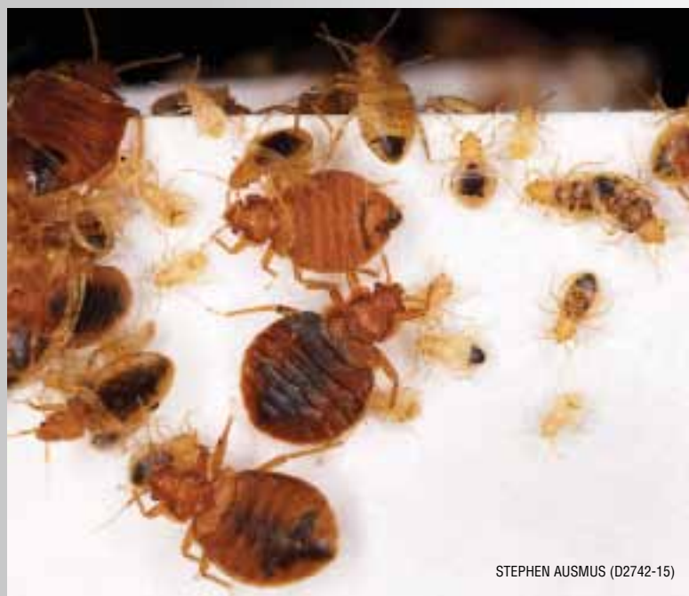
STEPHEN AUSMUS (D2742-15)

Above: Immature bed bugs molt and shed their skins only after blood feeding. ARS entomologist Mark Feldlaufer collects blood-fed, immature bed bugs that he will isolate in vials to collect individual shed skins for chemical analysis.