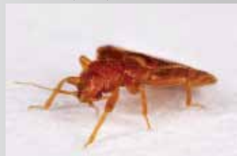
Above: An adult bed bug, Cimex lectularius , is roughly 4 mm in length. Immature and adult bugs are very flat, making it easy for them to hide in cracks and crevices.