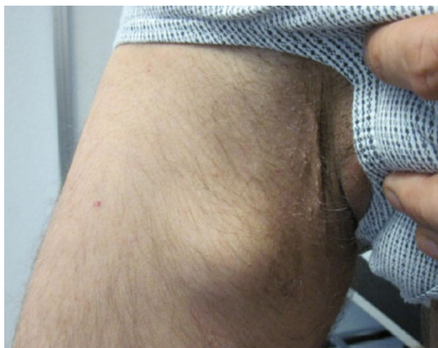
Fig. 1 The clinical presentation of the asymptomatic tumor on the right upper inner thigh