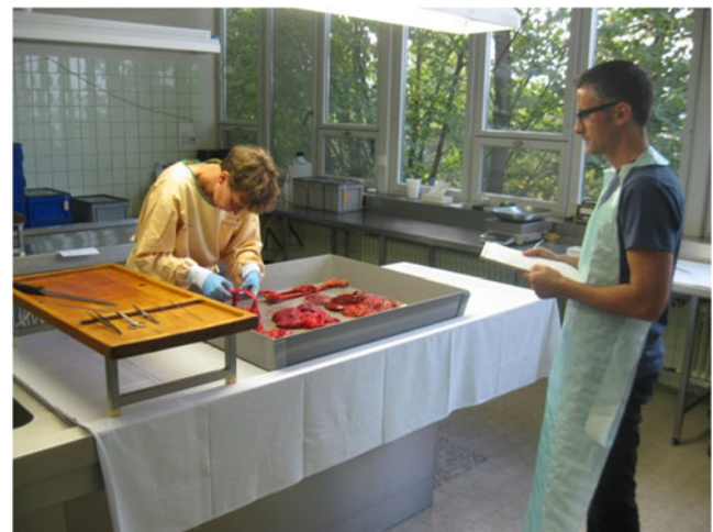
Fig. 2 Autopsy exam: Candidates are asked to examine the fresh organs of a recent autopsy usually in the autopsy suite of the hosting institute and describe their macroscopic impressions, which are being transcribed by one of the examiners (photo taken at the occasion of the exam in September 2011 in Lucerne, autopsy suite of the Cantonal Institute of Pathology)

The second part of the examination covers autopsy pathology. For 3 hours, the candidates have to analyze and describe the pathological findings of three autopsy cases and formulate a final diagnostic conclusion that also integrates the pertinent clinical information. Two of the three autopsy cases are based on collections of slides (10–16 slides of the major organs), accompanied by a description of the macroscopic findings and relevant clinical information, including specific questions raised by the clinicians. For that purpose, all candidates receive one of six identical