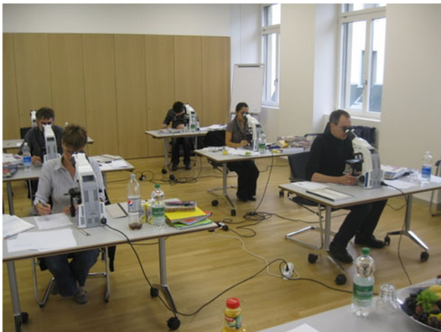
Fig. 1 Candidates dispose of high-quality diagnostic microscopes and their proper sets of slides. The use of standard textbooks is permitted during the parts where slides are examined, but prohibited during the theoretical part with multiple choice and open questions (photo taken at the occasion of the exam in September 2011 in Lucerne, in the rooms of the Academy for Medical Training and Simulation)

The main venue consists of a conference room with six tables on which the candidates find a diagnostic microscope as well as a collection of standard textbooks of diagnostic pathology which can be consulted freely during the slide sessions (Fig. 1). In addition, candidates are free to bring and use their own selection of textbooks for the diagnostic