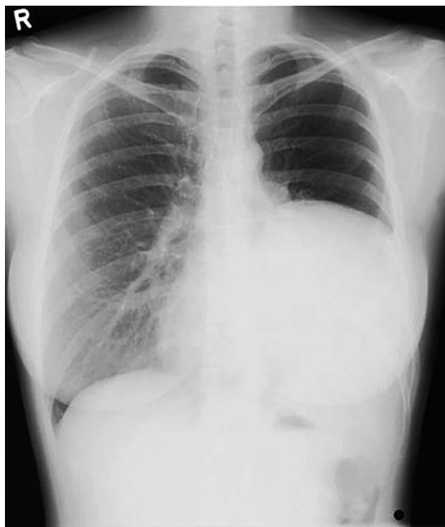
Fig. 1. Chest X-ray shows an apparent elevation of left hemidiaphragm.

avoiding dissemination. Surprisingly, the cyst contained hair and seborrhoeic liquid. Histological confirmation of a mature teratoma.