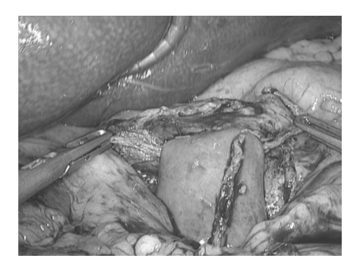
Fig. 2 New form of gastrojejunostomy in group B: circular anastomosis across the pouch staple line

During our experience, the gastrojejunostomy was always performed with a 21-mm circular stapler, but the precise technique was modified over time; in our initial experience, encompassing 639 patients (group A), the anastomosis was placed on the posterior wall of the gastric pouch (Fig. 1), and the entire circular staple line remained behind the transverse staple line used to divide the pouch. This usually left a small portion of gastric wall between the two staple lines. More recently, in the last 488 patients (group B), the anastomosis was placed across the staple line used to divide the gastric pouch, usually at the angle between the first and second firings, thereby avoiding to leave a narrow band of ischemic tissue between the two staple lines (Fig. 2). A few additional absorbable sutures,