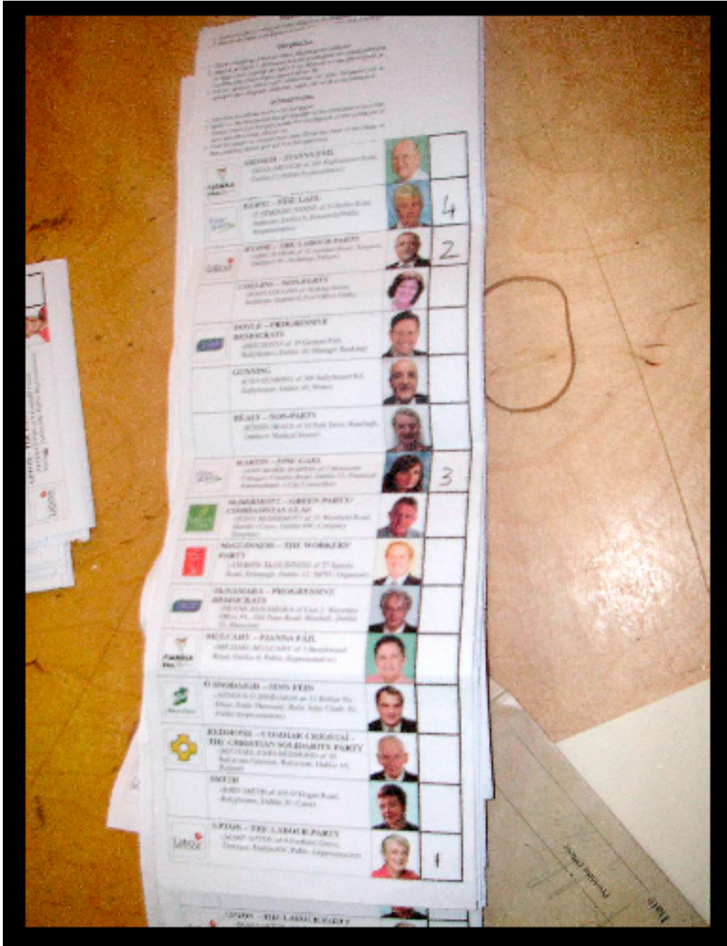
Figure 2: Irish 2002 ballot with 4 preference votes marked

supporters in an area to vote for particular candidates. Therefore they instruct their followers in great specificity as to how to order their preferences over candidates, as illustrated in Figure 3.