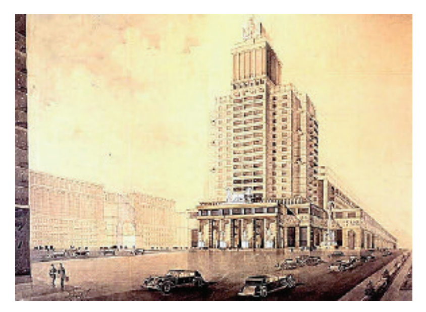
Figure 6 The House of Books project (1934)

As the state consolidated its power, it became more confident of its ability to integrate the past into its cultural agenda and set about creating its own 'Soviet-style' Acropolis. By the 1930s attitudes to the classical heritage began to change. New translations of the classics were commissioned and published in luxury editions. The regime's wish to be identified with images of imperial greatness led to a renaissance of neo-classical architecture. The project of 1934 for a new House of Books is typical of the rather monstrous designs of the period that tried to ape the grandeur of classical tradition. Mikhail Bulgakov (1891–1940) drew some rather uncomfortable parallels between Soviet Moscow and Roman imperial power during his work on The Master and Margarita in the 1930s.