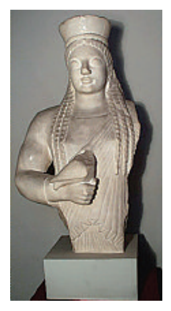
Figure 5 The Lyons Koré (ca 540 B.C.)

in space in another dimension over this horrific picture of cosmic catastrophe? Her three long braided tresses and dress make her look like an archaic Greek woman or goddess. She holds a small blue bird, possibly a dove, to her breast. As a sacrificial offering? If so, to whom or what? And why is she smiling, so unperturbed and detached, with her back to the scene of destruction below her. One thing is clear: she is looking at us, the viewers, and challenging us to make sense of her relation to the awesome scene behind her. Who can she be?