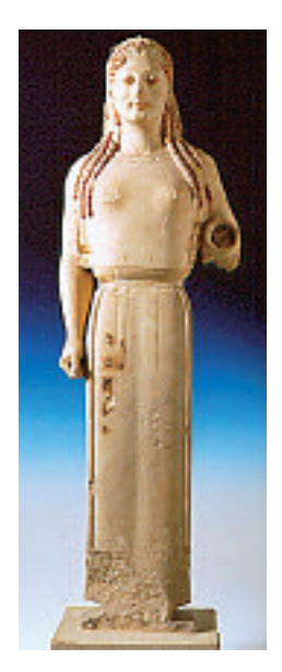
Figure 4 The Peplos Koré (ca 530 B.C.)