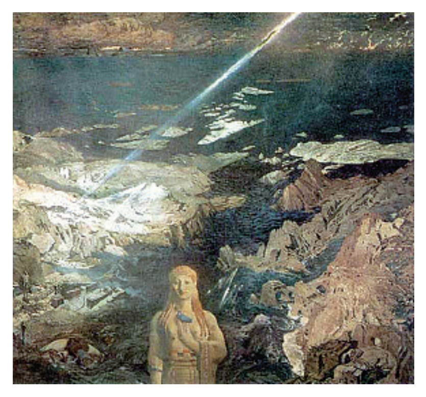
Figure 2 Lev Bakst, 'Terror antiquus' (1908)

a letter to his friend, the composer and music critic Walter Nouvel (1871–1949), proudly reporting on the painting's 'huge and resounding success', reflected in the forty reviews that he had collected from French and English journals.<sup>18</sup> The picture was then shown in St Petersburg at the Salon exhibition, organised by Sergei Makovskii (1877–1962) from 4 January to 8 March 1909, featuring over six hundred works by some forty artists.<sup>19</sup> It made a huge impact, not just because of its enormous size (at 2.5 by 2.7 metres, it filled an entire wall),<sup>20</sup> but also because it confronted viewers with a disturbing riddle – a powerful image of catastrophe alongside an enigmatic smiling female. What exactly was the artist trying to represent?