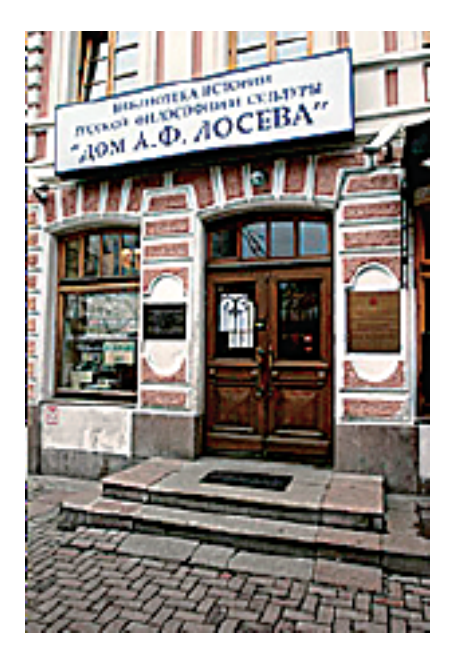
Figure 9 The House of A. F. Losev (2007)

was marked with a conference on the links between classical antiquity and Russian culture of the Silver Age, resulting in a fine book published last year.<sup>72</sup> Interviewed in 2007 for the journal The Elite of Society [Elita obshchestva], she emphasised the underlying unity of East and West that could be found in the world of classical antiquity and potentially recovered through serious study (in this connection it is interesting to note that Bakst also saw Greece as part of the East and often introduced Oriental elements into his Greek designs). She lamented the current 'exceptional decline' of culture in Russia, noting that schools in the 1930s and 1940s, even in the 1950s, were far better. Although books on classical antiquity are still being produced, some dilettante authors have entered the field. When asked to name the top classicists in Russia, she complained about the fragmented nature of contemporary scholarship no one could match the level and breadth of Zelinskii. Only Losev succeeded in combining the study of philosophy, philology, aesthetics, and mythology, because he still had 'zakvaska prezhniaia', the 'culture of the past' – in both senses of the term.<sup>73</sup>