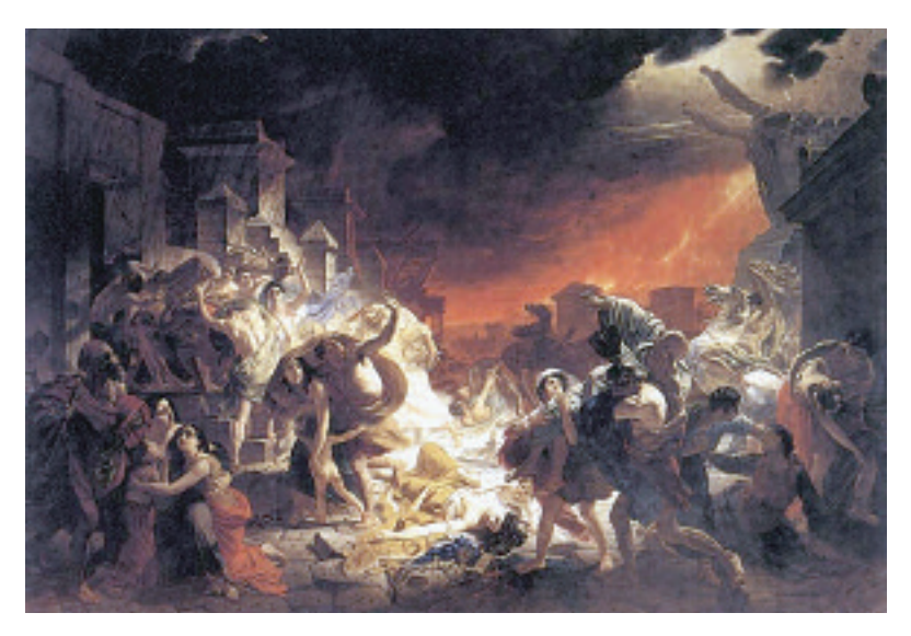
Figure 3 Karl Briullov, 'The Last Days of Pompei' (1833)

suggesting that this is the work of the gods. Beneath swirling clouds, the land masses divide, inundated by the sea, which is rapidly covering the mountains below, displayed like a map in relief. We can see small signs of human habitation and civilisation – on the right, fortress-like buildings, on the left, ships going under water, a temple, toy-sized idols on pillars, people scurrying about like ants – but all this seems very distant, too far away to matter.