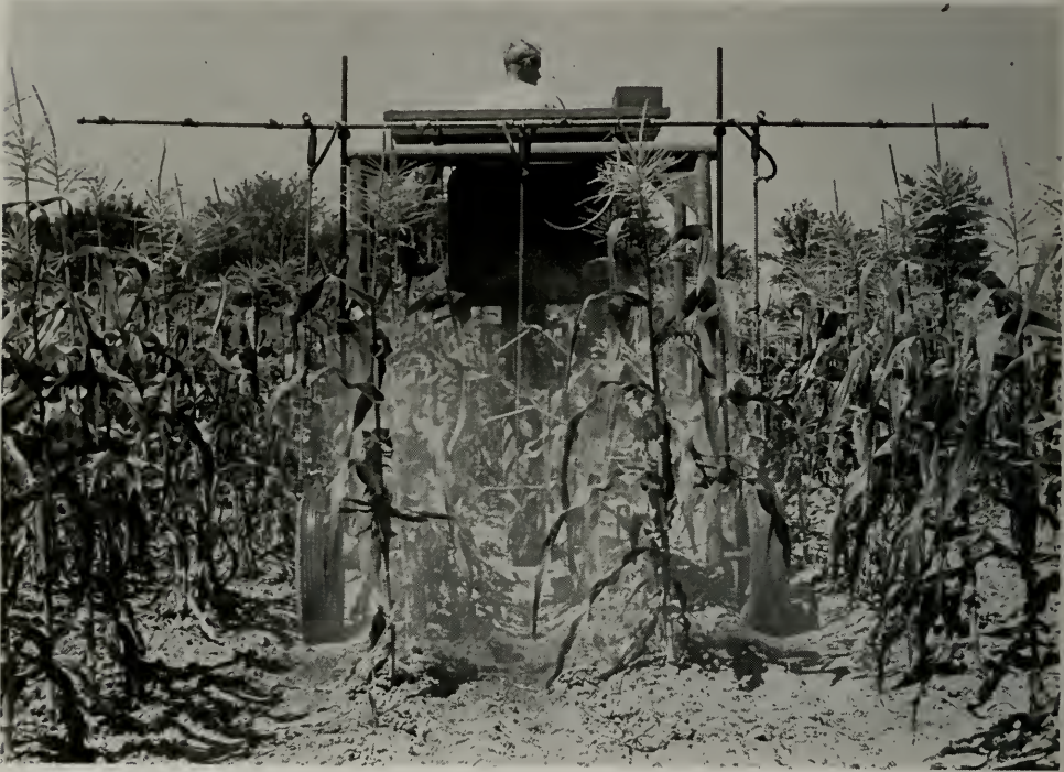
Spraying equipment developed in recent years by entomologists of the Illinois Natural History Survey for the control of the corn earworm and the European corn borer on sweet corn and field corn.

The value of predators and parasites was not overlooked, and at times different kinds of poultry, particularly turkeys, were noted as effective control agents. Hellebore, London purple, and calcium arsenate were later added to the list of