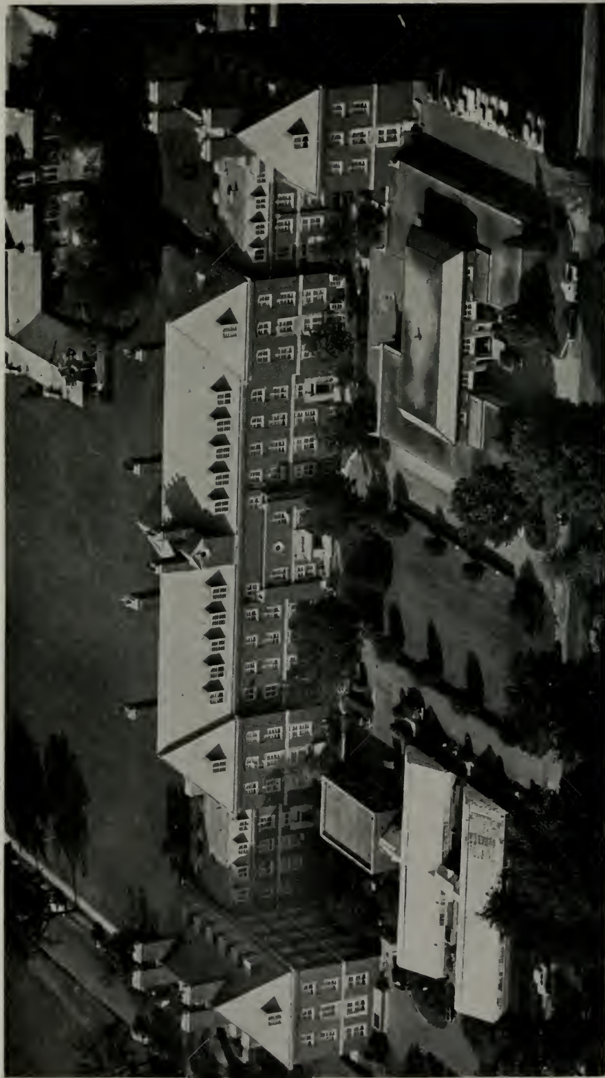
Aerial view, from the south, showing the Natural Resources Building on the University of Illinois in Urbana-Champaign. The central part of the building was completed in 1940, the two wings in 1950. The main offices and laboratories of the Illinois Natural History Survey occupy most of the west half of the building. The experimental greenhouse and its service building are shown in the left foreground.