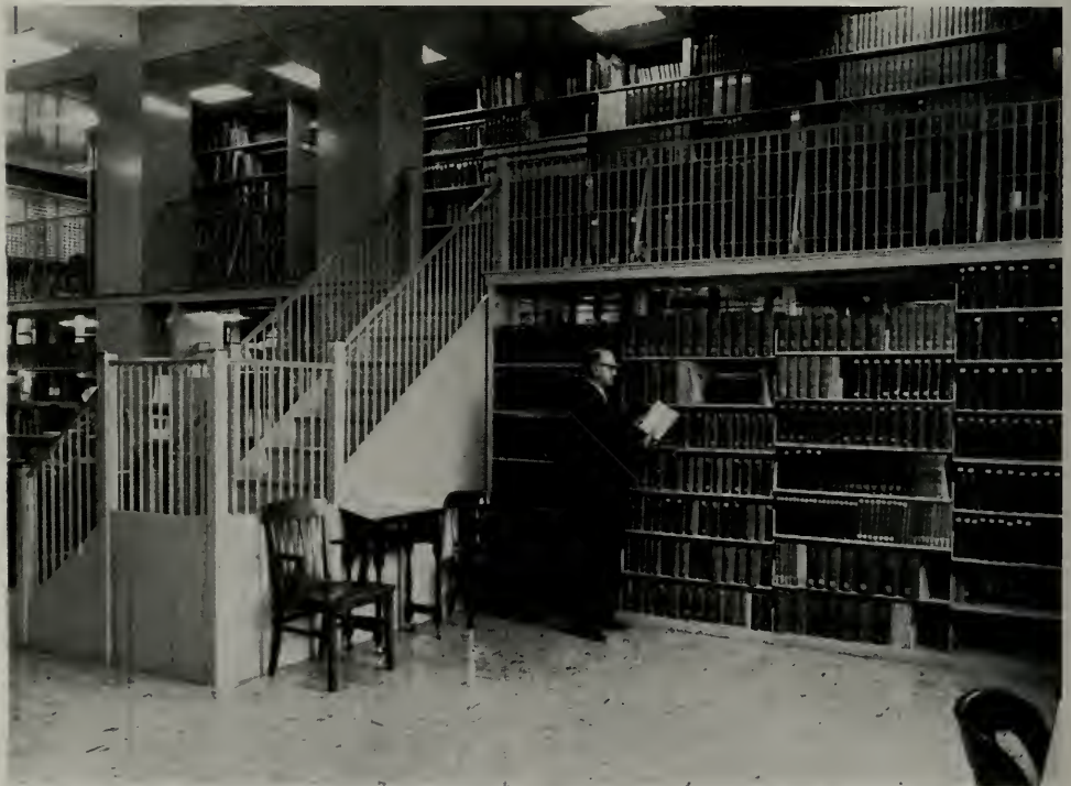
Part of the Illinois Natural History Survey library in the Natural Resources Building. This library is noted especially for its large collection of bound volumes of periodicals in the biological sciences.

We are now receiving in exchange for our State Laboratory Bulletin one hundred and eighty-one periodical scientific publications, of which fifty-nine are American, twenty-eight are British or British-colonial, twenty-six are German, sixteen French, twelve Italian, and the remaining forty are Russian, Swedish, Norwegian, Danish, Dutch, Hun-