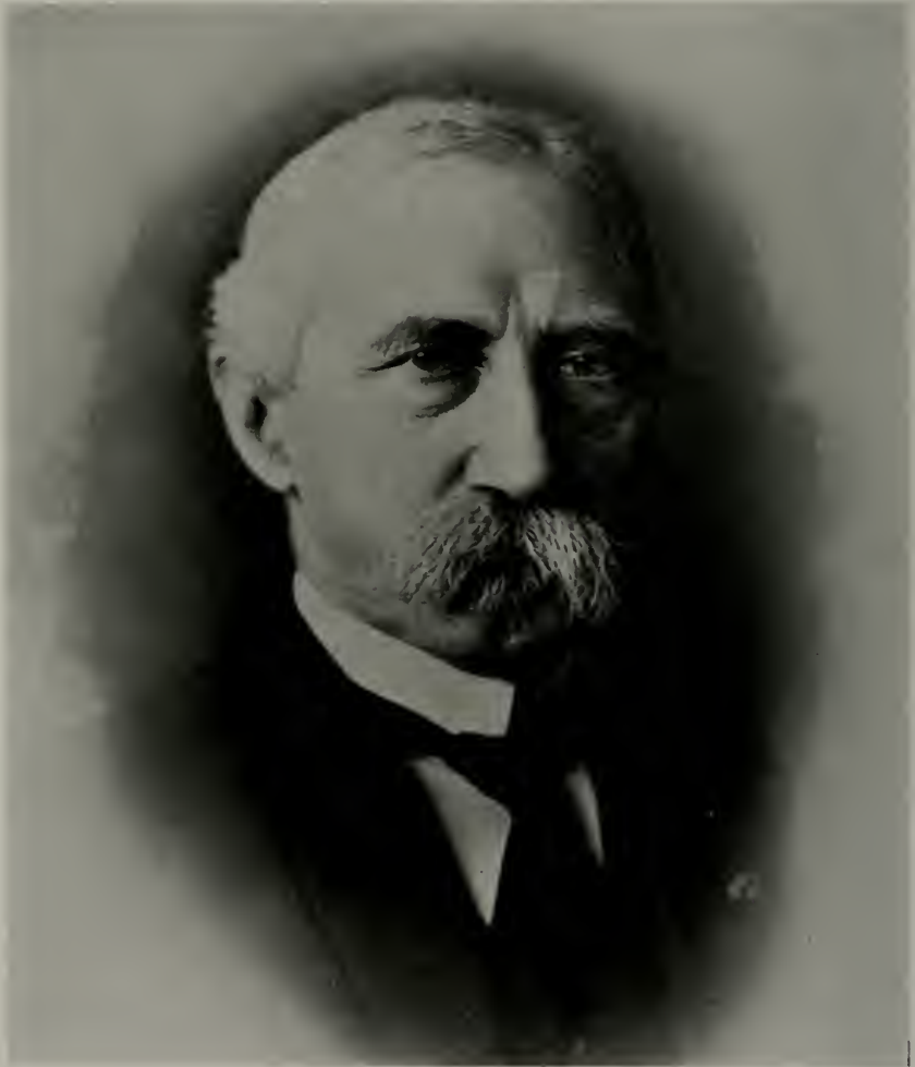
Stephen Alfred Forbes in about 1915, shortly before being named Chief of the Illinois Natural History Survey at Urbana.

He was a member of many learned societies and the recipient of many honors.