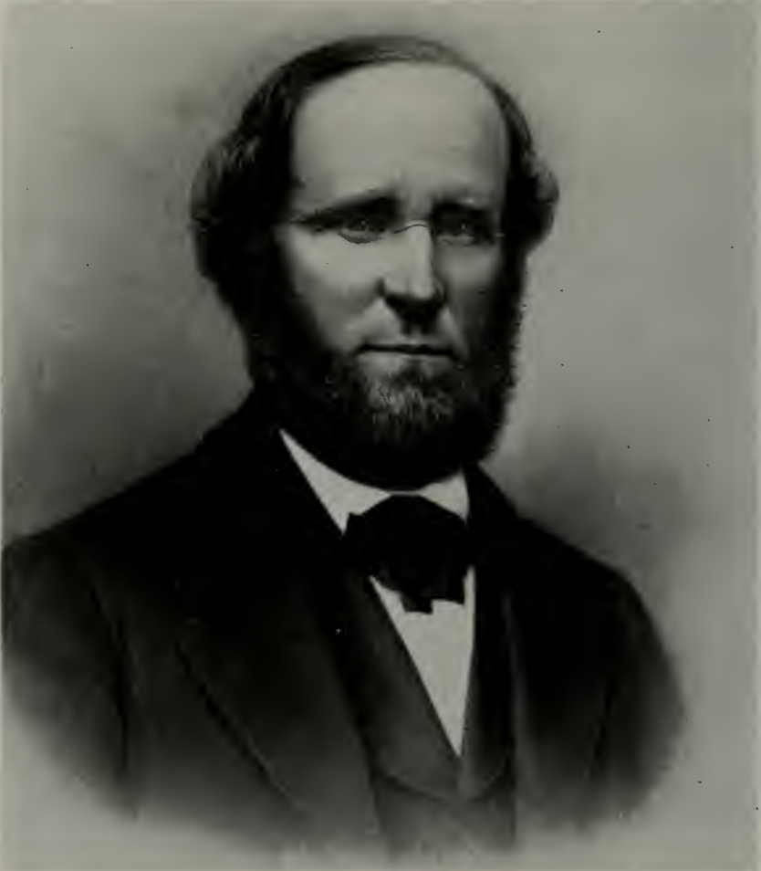
Benjamin Dann Walsh, State Entomologist, 1867-1869.

He [Walsh] performed as well as he could his various duties of private, captain, colonel, adjutant, and major-general of this new force—and in two years he was dead. He had two successors enlisted for the war on precisely the same terms, the first of whom, Dr. Wm. Le Baron, of Geneva, Illinois, maintained for five years the unequal contest, when he also died; and the second, Dr. Cyrus Thomas, of Carbondale, abandoned the field in despair after seven years of diligent service, going then to Washington for work in another department of science, where he lived to the good old age of eighty-five. I have sometimes wondered if his long survival was