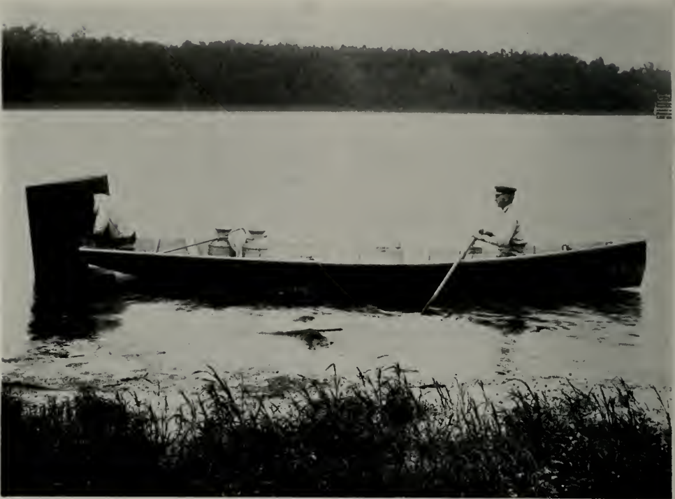
Two members of the staff of the Illinois State Laboratory of Natural History making observations on the breeding habits of fish near Havana, 1910 or 1911. The box at the stern of the boat was used by observers in watching the movements of fish and in searching for fish nests and fry.