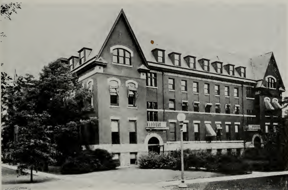
The Natural History Building on the University of Illinois campus. About 1894 headquarters and laboratories of the Illinois State Laboratory of Natural History and of the State Entomologist were moved into this building. From July 1, 1917, until the middle of 1940 it housed the main offices and most of the laboratories of the Illinois Natural History Survey.