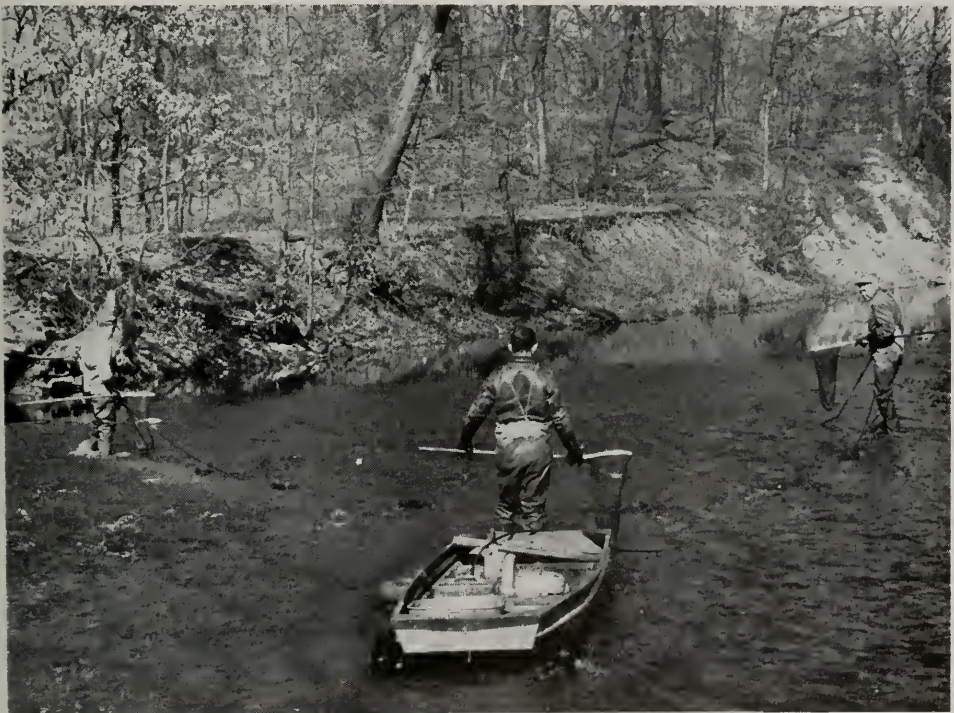
Fisheries technicians of the Illinois Natural History Survey using fish shocker for sampling the population of a stream. The shocker is a recent development that has been used successfully in both streams and lakes.