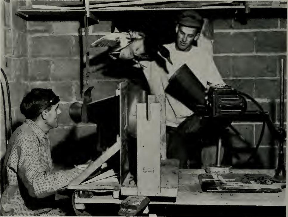
Wildlife technicians preparing to fluoroscope a mallard drake at the Illinois Natural History Survey field laboratory near Havana. The fluoroscope has facilitated studies involving crippling by hunters and lead poisoning.