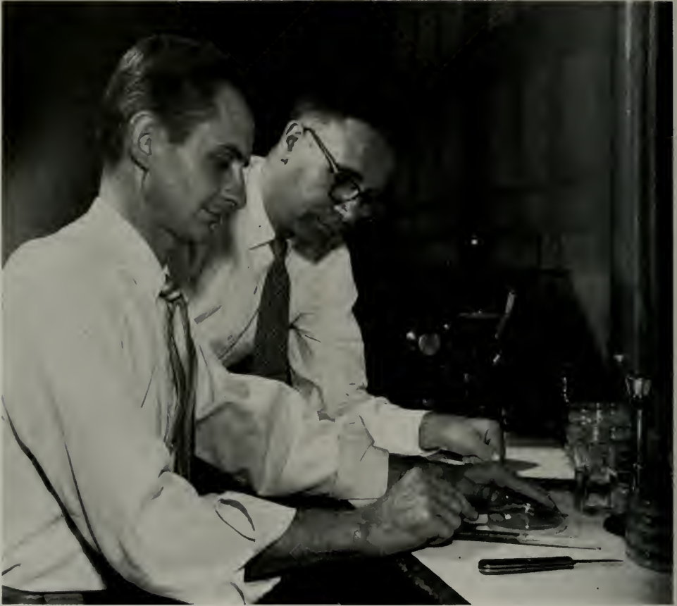
Plant pathologists of the Illinois Natural History Survey culturing sample of American elm suspected of being affected by the Dutch elm disease. Modern laboratory equipment enables the plant pathologists to substantiate field diagnoses.

Urbana in 1951. The numbers of affected trees in succeeding years in Champaign and Urbana were 11 in 1952, 164 in 1953, 694 in 1954, 1,805 in 1955, 1,836 in 1956, and 2,116 in 1957. These 6,627 diseased elms represent over 44 per cent of the elm population of Champaign and Urbana when the disease was first found there.