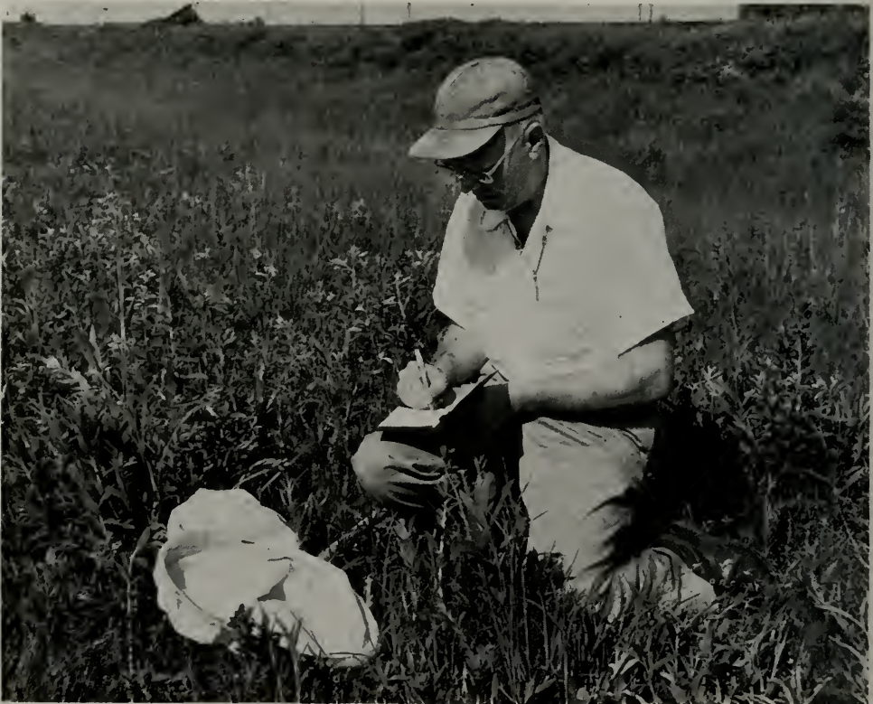
An Illinois Natural History Survey entomologist making field notes relating to insects he has collected. The association of insects with their host plants is an important phase of the work of Survey entomologists.