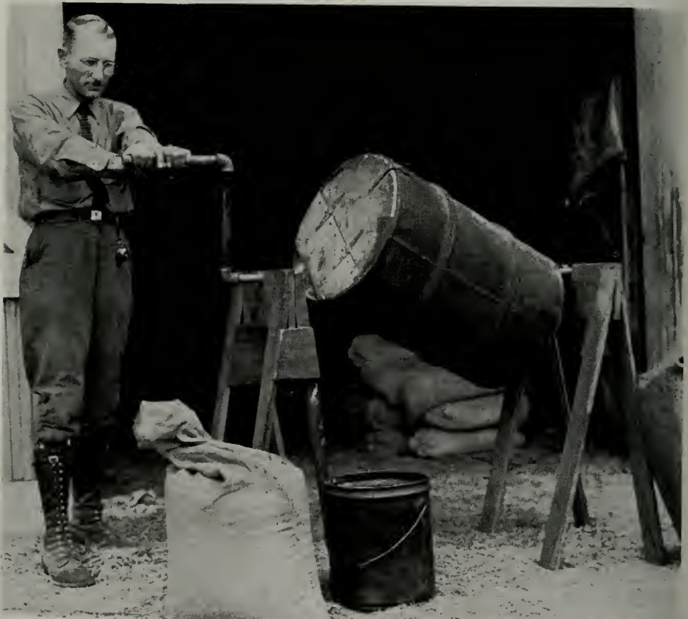
Homemade mixer used about 25 years ago by plant pathologists of the Illinois Natural History Survey to demonstrate effectiveness of chemical treatments in control of seed-borne diseases of small grains.

The estimated annual losses resulting from diseases of corn usually are greater than the losses resulting from diseases of wheat. In the past decade the lowest estimated reduction in corn yield, 54,250,000 bushels, valued at $82,450,000, occurred in 1952 and the highest estimated reduction in yield, 168,100,000 bushels, valued at $198,358,000, occurred in 1949. The average annual estimated reduction in yield of corn in Illinois during the past decade was 90,626,100 bushels, valued at $112,139,072.