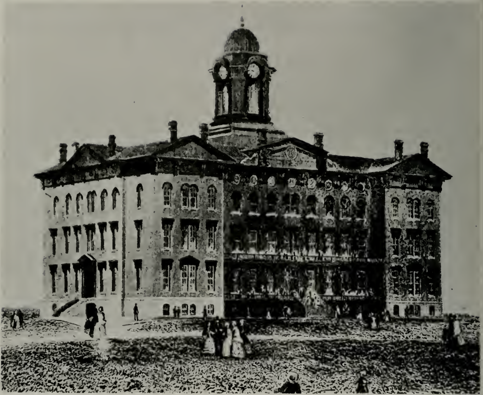
The original building of the Illinois State Normal University, Normal, Illinois, spring, 1880. In this building the Illinois Natural History Society was founded and its museum was housed. Here the Illinois State Laboratory of Natural History had its headquarters from its founding in 1877 until late in 1884, and here the fourth State Entomologist was located for approximately 2 years.