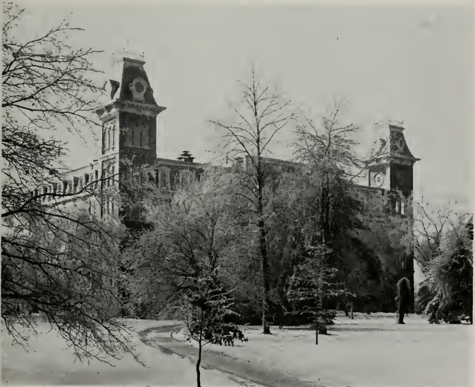
University Hall on the University of Illinois campus. This building, completed in 1874 and razed in 1938, was headquarters for the Illinois State Laboratory of Natural History and the Office of State Entomologist for a few years after they were moved from Normal to Urbana.