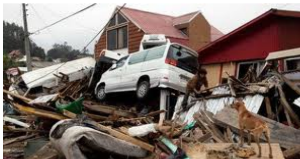
Fig. 1 Damaged caused by the earthquake

On Friday 27 th February 2010 at 3:40 am, a terrible earthquake measuring 8.8 on the Richter scale rocked the central territory of Chile. Hours later a terrible Tsunami hit a large part of its coastal region. This event spanned a longitude of 630 km causing damages in at least six regions of the country which concentrate 75% of national population. Besides the destruction and all the panic, the quake caused an instantaneous black out for more than four days. As a result of this black out, cities suffered severe difficulties related to provisions, communication and safety, to name a few. This situation demonstrated the vulnerability of Chile electrical grid and the people's dependence of energy.