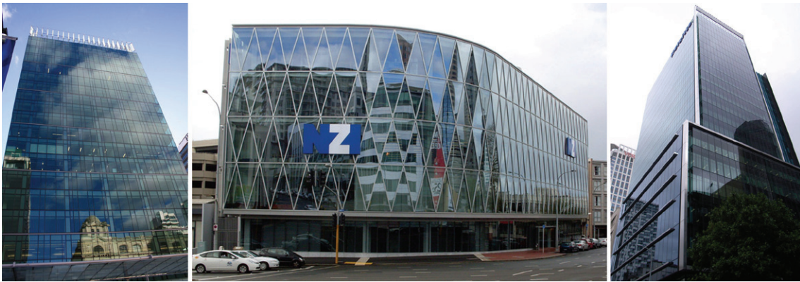
Fig. 2. Examples of recent ‘green’ rated buildings in Auckland, New Zealand

A review of a prominent ‘green’ rated building in New Zealand [20] stated that “Extensive and detailed modelling of the building facade was undertaken to determine a system that would provide the best balance of light transmission versus heat gain.” This particular building is almost 90% glazed with little solar protection and is fully air conditioned, thermally lightweight and is conspicuous by its artificial lighting that remains on for much of the day. According to the architectural science modelling methods described above (2.1) as well as the Lawrence Berkeley Laboratory report [12] and ASHRAE standards referred to [15], such a building envelope is inherently energy inefficient.