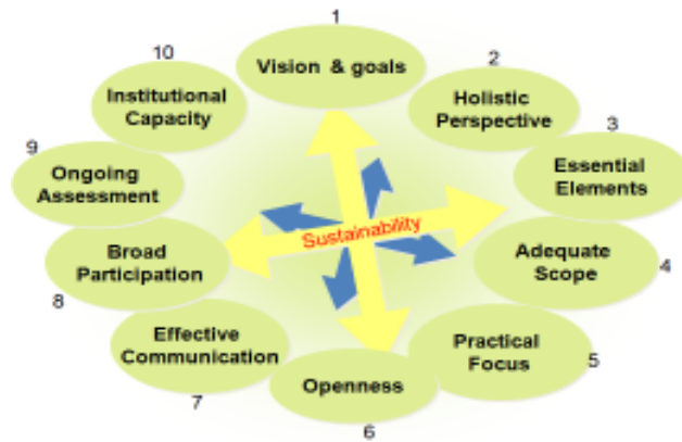
Figure 4 – The Bellagio Principles towards sustainability

In any case, the frameworks, the categories of data, the information and the choice of specific measures, reflect the values, biases, interests, and insights of the participant designers. In addition, value-driven principles are often developed as part of strategic planning exercises linked to such interests and various initiatives. The provision of insights and guidelines for attaining competitiveness and sustainability requirements, under variant product and market conditions, is critical for regional SMEs that produce high quality agricultural products, like the following case of Union of Agricultural Cooperatives, in the Messinia region, Greece.