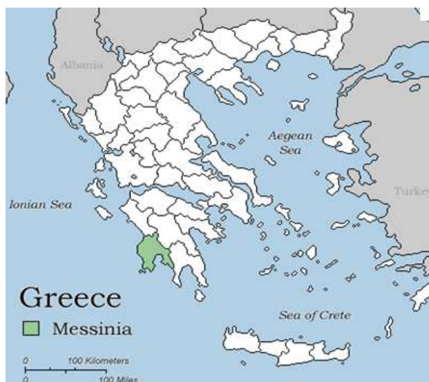
Map 1 - Messinia region , Greece

The Union of Agricultural Cooperatives (UAC) is located in Messinia region, Greece. Lying at the south-western most tip of the Peloponnese, Messinia covers an area of 2.991 square kilometres, has 210.000 residents and is administratively separated into 29 Municipalities and 2 communities (Map 1). It enjoys favourable climate conditions, in combined temperature, humidity, etc. for producing high quality farm products for health and special flavour, and recognition by the EU as PDOs for these reasons. The capital of the region is Kalamata, the most important harbour of the Peloponnese after Patras.