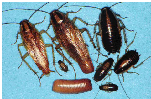
Figure 1. German cockroach.

Some people see a cockroach and immediately grab a can of bug spray, but a quick spray from an aerosol can won't provide long-term control. Ingredients in most aerosol and "bomb" treatments repel cockroaches. Using these products can cause the cockroaches to hide deeper inside walls and be more difficult to control later. To make the most of your efforts to control cockroaches, use a multiple tactic approach. First, you need to understand a little about the cockroaches that live in our homes, what they need to survive and how to eliminate them.