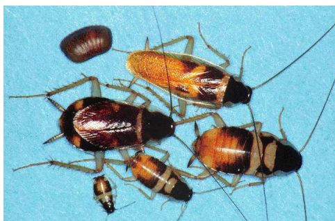
Figure 3. Brownbanded cockroach.