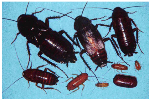
Figure 2. Oriental cockroach.