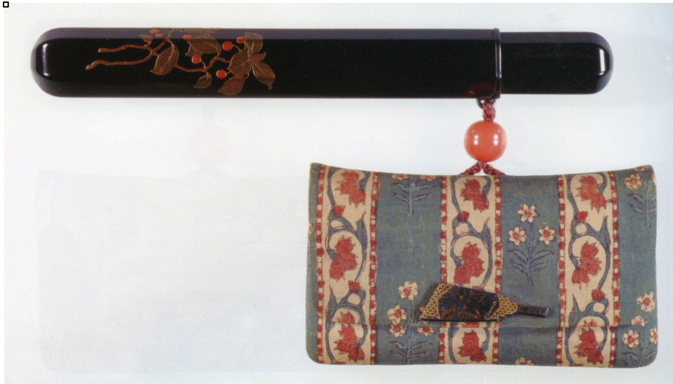
Figure 10. Cigarette case, Tobacco and Salt Museum .(Tobacco, 2005, p. 180.)

another example in a private collection feature a part of an Indian painted textile with figural design at the center. 27 This kind of painted textile depicting Indians and Westerners wearing hats and trousers was popular in the early 17 th century, and related pieces are stored in several museums in England and the United States. Other parts of this hanging scrolls are also decorated with Indian textiles of different designs. These examples indicate how highly these hand-painted Indian textiles were admired by the Japanese and how creatively they were accepted in their own cultural settings.