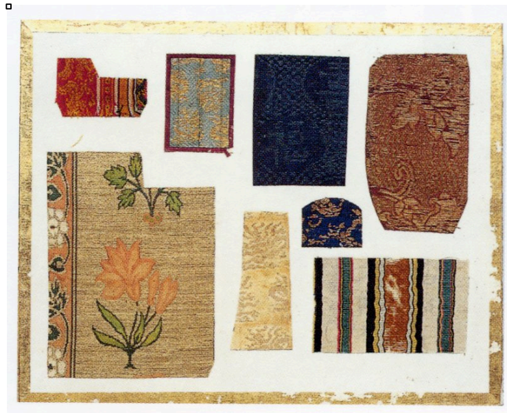
Figure 7, left. Textile, Persia or India, 17 th century, Yōmei Bunko (Tokyo, 2008, p. 142.)