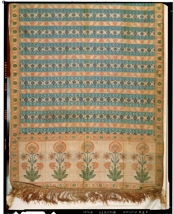
Figure 3, left. The robe of Kōgetsu Sōgan, Daitokuji-temple. (Kyoto, 1985, p. 24.)