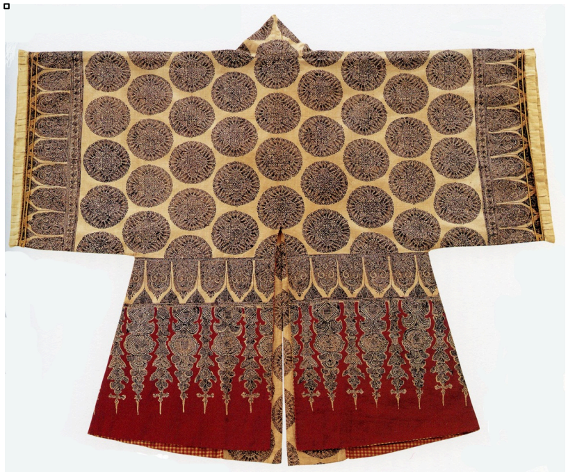
Figure 1, left. The coat of Toyotomi Hideyoshi, Kōdaiji Temple. (Sugimura, 1994, p. 147.)