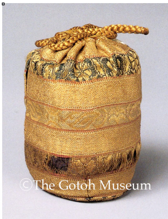
Figure 5, left. Textile, Persia or India, 17 th century, Kyoto National Museum. (Kyoto, 1979, vol. 2, p. 147.)