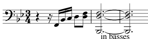
Figure 5- Opening motive in bassoons from mm.2-4

Busch creates the open space immediately, however he does not abandon tertian harmony as he closes every presentation of the opening motive with a third to give the chord its modality. This entire A section is built off the fourth and fifth interval. The motives introduced at m.12 and presented in the style of hocket is a clear example of the prevalence of the fourth and fifth interval. Busch not only uses the open interval vertically, but also horizontally. This is seen in the motives presented at mm.12-14. The emphasized pitches are E-natural and B-natural with A-natural serving as a non-chord tone.