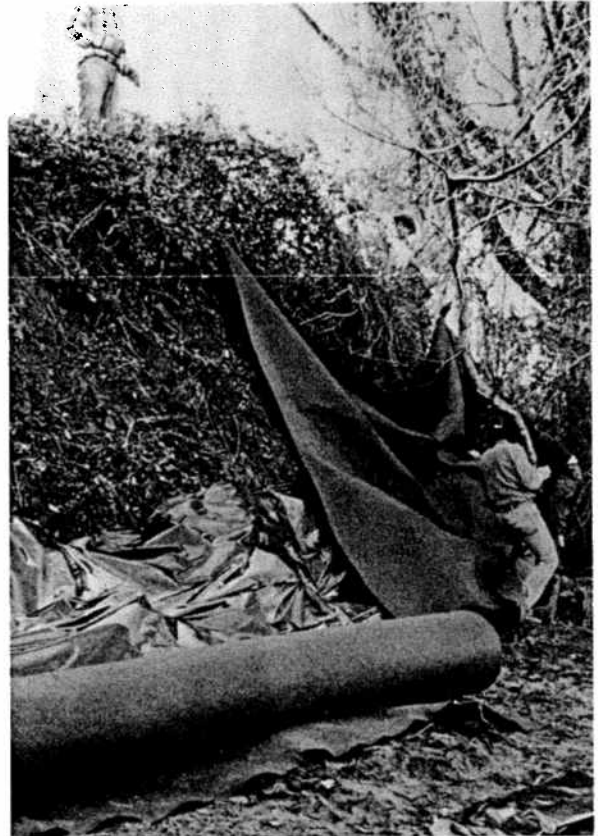
Figure 3. Installing filter fabric

The final step in the stabilization process was the preparation of a report describing the activity that has been undertaken (Thorne 1987).