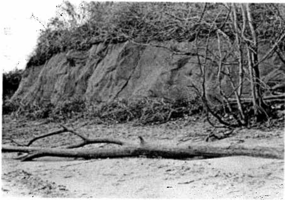
Figure 4. Present appearance of site

Detailed references to the work at Huffine Island include Thorne 1987; 1988. A VHS format video tape that will last between 12 and 15 minutes is currently being prepared and will be available in June, 1988 from the Center address shown below. The tape will be made available on a loan basis.