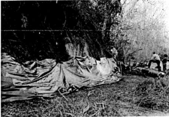
Figure 2. Installation of underliner

underliner would be to protect the portion of the fabric that would be submerged by the lake water. It was considered possible that the submerged fill material in the mound would be melted during the period of submersion and the silt sized particles would then be trapped in the pores of the fabric. Filling of the pores would not only retard the passage of rainwater during low water periods, but the accumulated soil would add weight to the fabric. This added weight would then in turn put additional stress on the pins that hold the fabric in place. To prevent this situation from developing, an underliner of black polyethylene (6 mils) was installed along the face of the mound to a height of 4 ft, well above the high water line on the face of the mound.