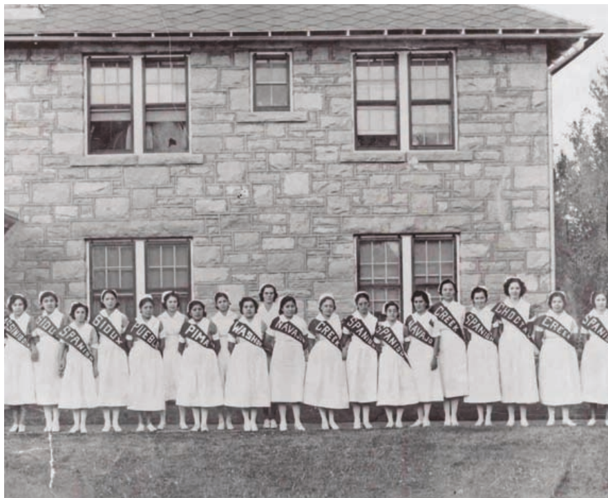
Nurses wearing sashes that indicating their ethnicity, pose in front of the Nurses Home for Sage Memorial Hospital School of Nursing, circa 1940.