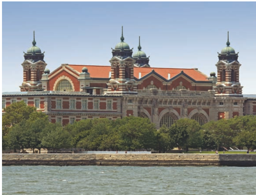
The immigration museum on Ellis Island, New York