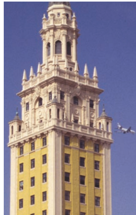
Designated a National Historic Landmark on October 6, 2008, Freedom Tower served as a place of refuge for Cuban immigrants to the United States from 1962 to 1974.