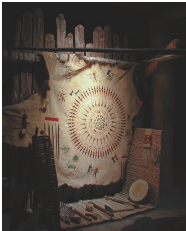
Native American art and tools.