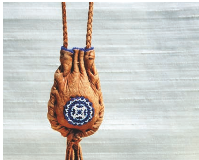
Native American medicine bag.

The initial workshops for Writing and Managing a Successful Grant are scheduled for May 20–21 in Seattle, Washington, and September 15–16 in Chicago, Illinois. The first Determining Cultural Affiliation workshop will be held on September 14 in Chicago, Illinois. Each will be offered twice a year. Tribal representatives are eligible for a scholarship to cover registration for either workshop. Small museums may receive a scholarship for the Determining Cultural Affiliation workshop. Registration and scholarship information is online at www.npi.org or www.nps.gov/history/nagpra .