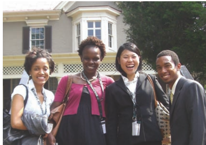
Four of the 2008 CRDIP Interns pose in front of the Frederick Douglass National Historic Site during their visit to Washington, DC for the three-day Career Workshop in August 2008.