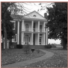
Vann House, connected to the Cherokee Trail of Tears in Georgia, was recently listed in the National Register. See page 7.