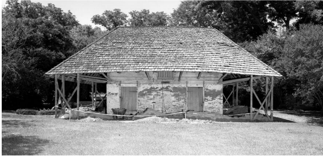
(Right) Stunning in its appearance, the Africa House at Melrose Plantation reflects the cultural continuity between enslaved African Americans and their West African antecedents.