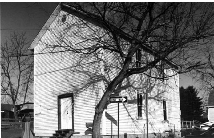
(Left) Odd Fellows Hall once served as a meeting hall for the African American community, Blacksburg, Virginia, during the first half of the 19th century.