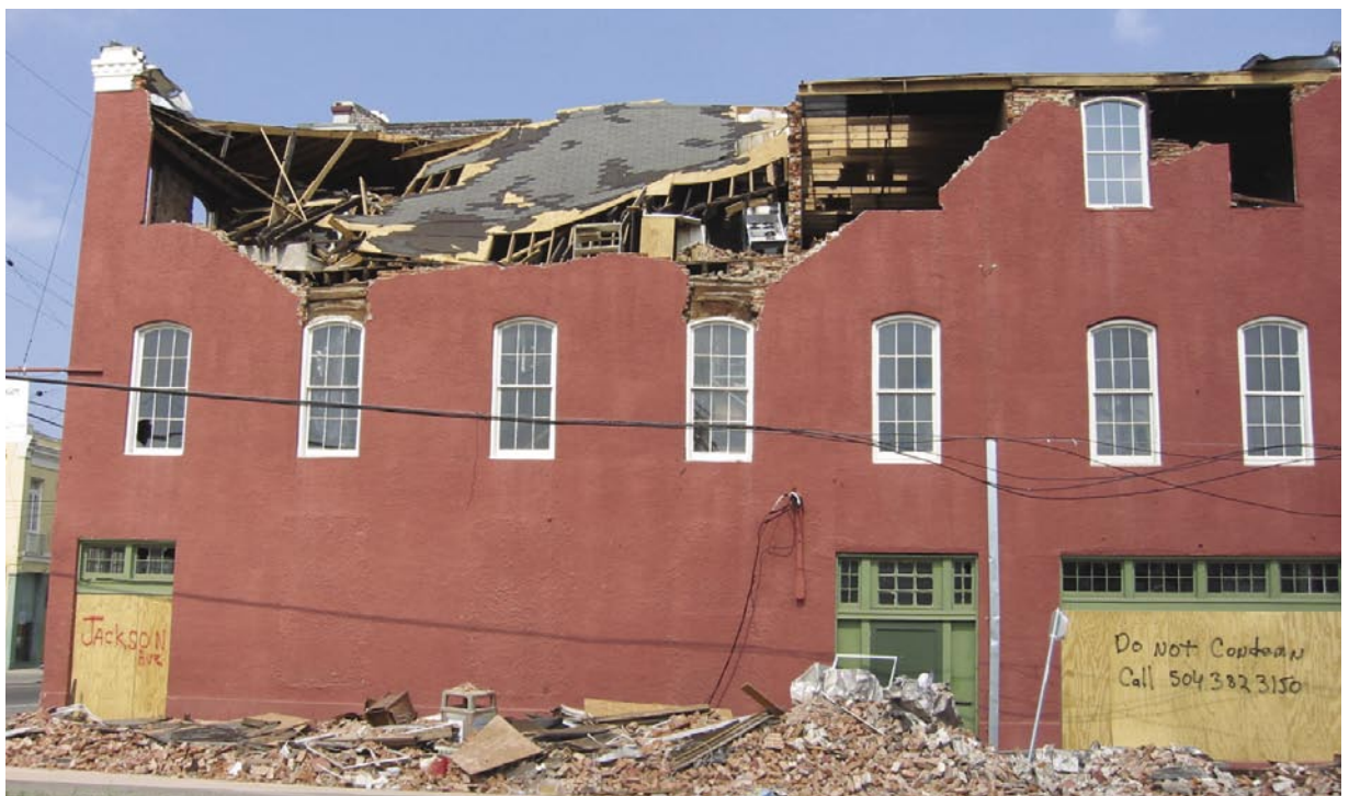
This historic commercial building at the corner of Jackson Avenue and Magazine Street in the New Orleans Garden District illustrates the severe damage caused by both wind and water during Katrina. African American-owned properties were particularly hard hit throughout the Gulf Coast.