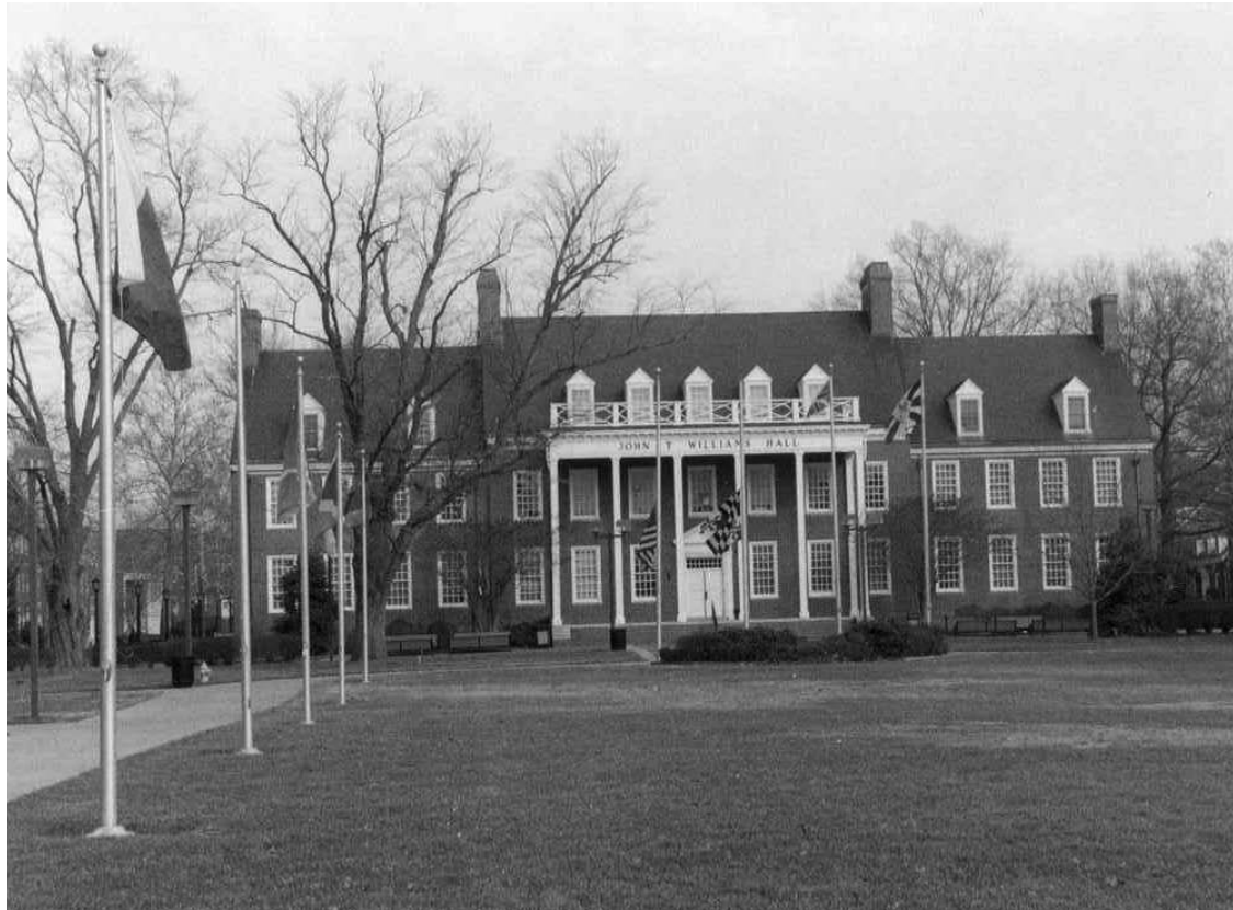
(Top) J.T. Williams Hall, named for a former chief executive officer, serves as the main administration building for the University of Maryland Eastern Shore.

The University of Maryland Eastern Shore was listed in the National Register of Historic Places for its association with higher education and ethnic heritage.