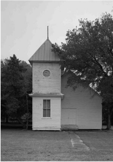
(Left) St. Charles Chapel, in Natchez, Natchitoches Parish, sits just across from Beau Fort Plantation and served the Bermuda community after its dedication in 1910.