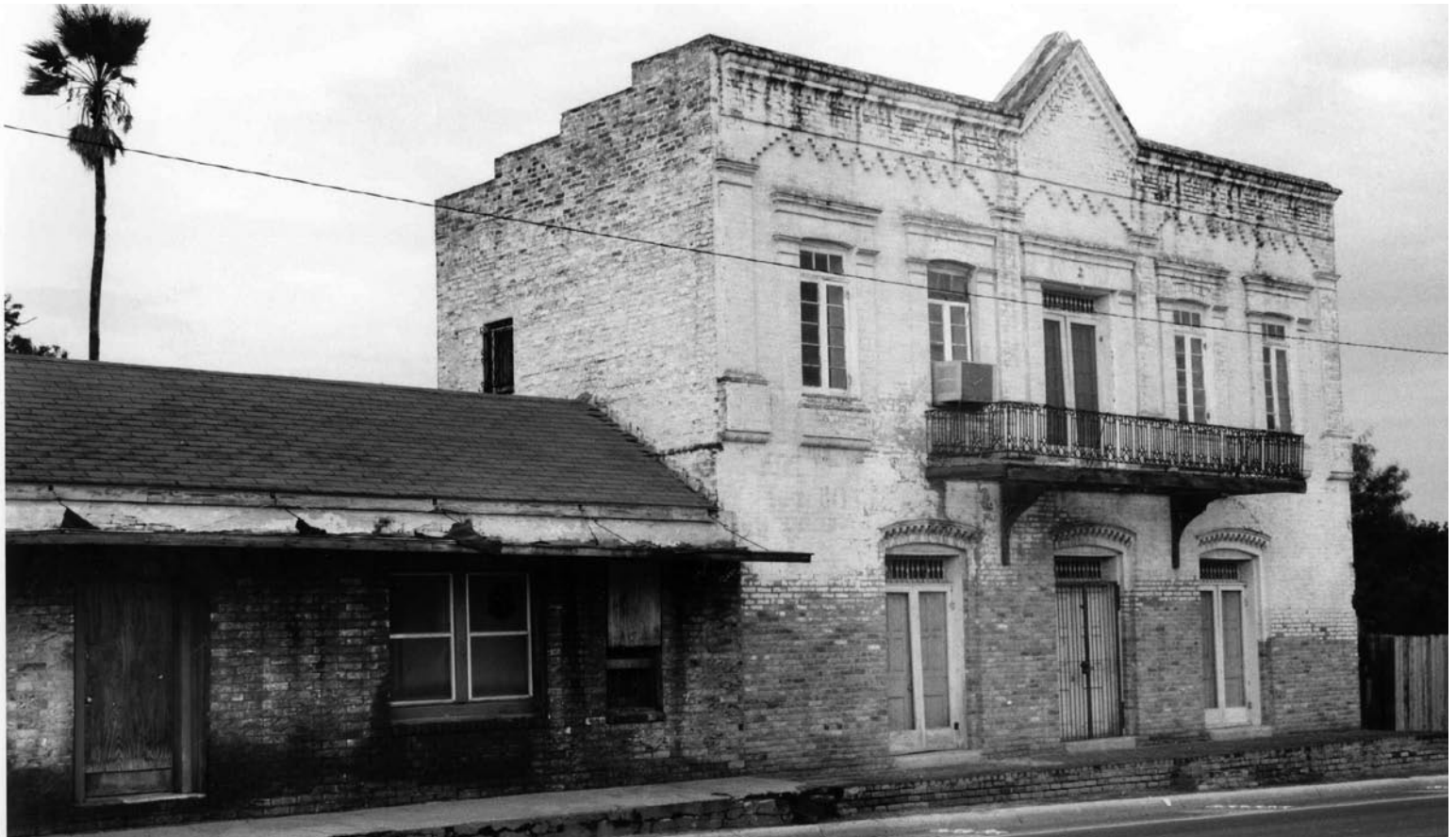
(Above) The Renaga-Headley-Edgerton House located on Second Street, is one of 84 contributing resources to the Rio Grande City Downtown Historic District, Texas.