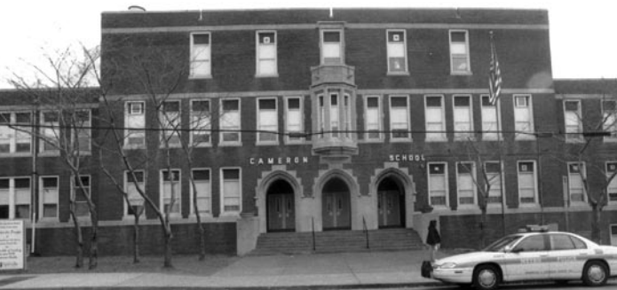
(Below) Cameron is one of two African American schools built in Nashville, Tennessee, as part of Roosevelt's New Deal Era programs.

and died in service to his country. It stands as one of the first schools in Nashville to honor of an African American and served as one of the central social institutions for the African American community.