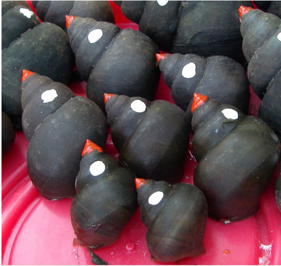
Figure 1. Chinese mystery snails marked with paint on the nuclear and penultimate whorls.

Given the potential impacts of invasive freshwater snail species and questions regarding the enumeration of snail populations, we utilized a mark-recapture technique to (a) determine its appropriateness for Chinese mystery snails and similar species and to (b) estimate the population of Chinese mystery snails within a Nebraska reservoir. We also developed estimates of density and biomass from the population estimate. This is the first known demonstration of applying mark-recapture techniques to generate a population estimate for the invasive Chinese mystery snail.