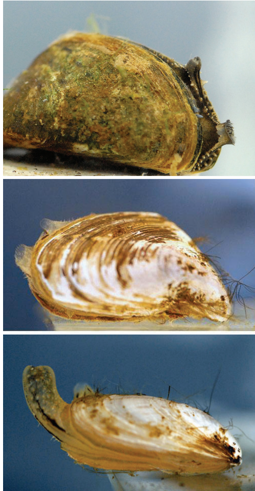
Figure 1. Comparison of the incurrent siphon of the zebra mussel (top), quagga mussel-epilimnetic phenotype (middle), and quagga mussel-profunda phenotype (bottom). Note the longer siphon of the profunda phenotype.

components of the food web are affected. Several articles have provided excellent, detailed summaries of ecological impacts of dreissenids (Strayer and others, 1999; Vanderploeg and others, 2002), so only far-reaching changes that have strong implications to resource managers will be presented here. Dreissenids are filter feeders and hence remove phytoplankton and other particulates from the water. These filtered particles are ingested and assimilated or deposited on the bottom as feces or pseudofeces. Feces is material that is ingested but not assimilated, and pseudofeces is material that is filtered but not ingested (rejected). As a result of these filter-feeding activities, dreissenids divert food resources from other food web components, such as invertebrates inhabiting both the water (zooplankton) and bottom sediments (benthos). On average, dreissenid colonization in a given lake or river has been accompanied by a greater than 30 percent increase in water clarity, a greater than 35 percent decline in