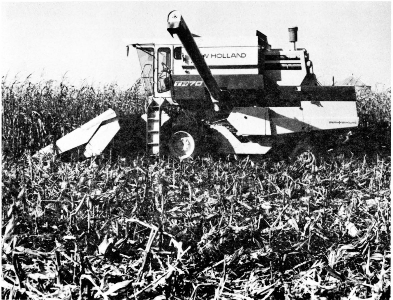
A combine with a full grain tank can weigh as much as 20 tons per axle; a tremendous force for compaction if you use it when soil conditions are not right.

compaction occurred. Corn yields were reduced 25 percent the first year after the compaction and 15 percent the second year.