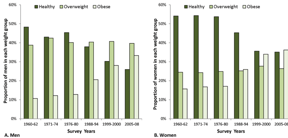
Figure 1. The distribution of body mass index (BMI) is illustrated over time for adult (ages 20-74 years) (A) men and (B) women by sex and survey year: United States, 1960 to 2008. Body mass index (BMI) is calculated as weight in kilograms divided by height in meters squared. BMI in the range 18.5-24.9 kg/m 2 is considered healthy weight (dark green bars), BMI in the range 25-29.9 kg/m 2 is considered overweight (medium green bars) and BMI ≥ 30 kg/m 2 is considered obese (light green bars). Prevalence was age-adjusted to the 2000 US standard population using five age groups: 20-34 years, 35-44 years, 45-54 years, 55-64 years, and 65-74 years. Data are from the National Health and Nutrition Examination Survey except data for 1960-1962 which are from the National Health Examination Survey. Source: National Center for Health Statistics. Health, United States, 2010: With Special Feature on Death and Dying (Table 71). Hyattsville, MD. 2011. 29

has decreased significantly, although not uniformly, since 1992. 15 Prostate cancer death rates also have decreased substantially over time. The contribution of PSA testing to this decline and the risks and benefits for individual men remain uncertain. 50