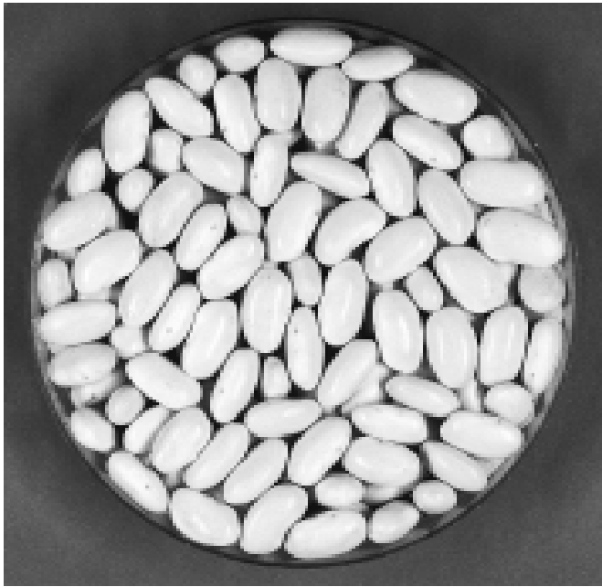
Fig. 2. Seed of 'Weihing' Great Northern dry bean (formerly GN WM3- 94-9).