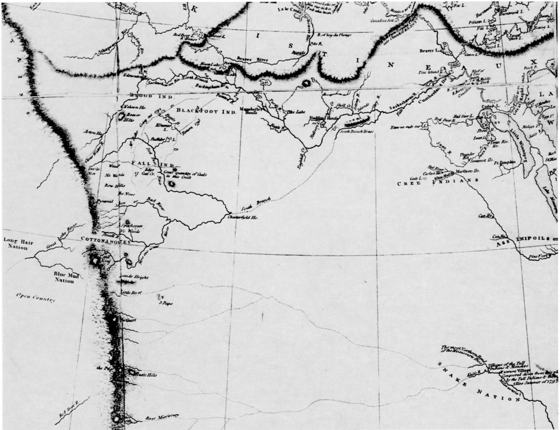
FIG. 3. Arrowsmith 1802: Aaron Arrowsmith. Map Exhibiting all the New Discoveries in the Interior Parts of North America, Inscribed by Permission to the Honorable Governor and Company of Adventurers of England Trading into Hudson's Bay, In Testimony of their liberal Communications. 1795. Additions to 1802 . (detail). Courtesy of the National Archives of Canada NMC 19687.

Alexander Dalrymple, the Admiralty's hydrographer, both of whom were well known for their interest in exploration. 44 Arrowsmith seems to have used Fidler's two maps, received some time between late October and mid-December 1802, for the second issue dated 1802 (the sixth state) of his Map Exhibiting all the New Discoveries .