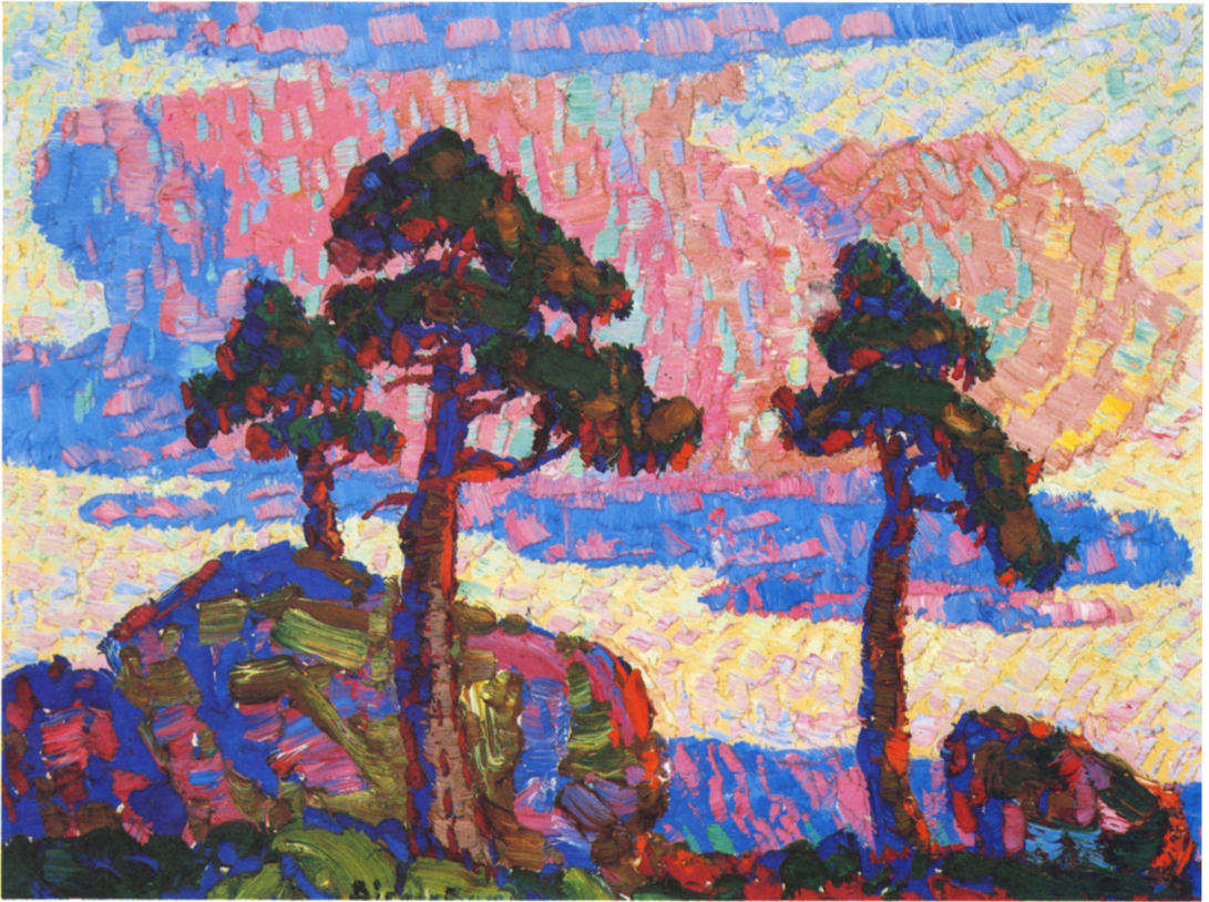
FIG. 3. Sunset, Colorado. Oil on canvas, 12 x 16 inches, 1922. Privately owned.

The color arrangement however simple it might be, should support and enforce the lines. A false arrangement of color might completely destroy the rhythm.