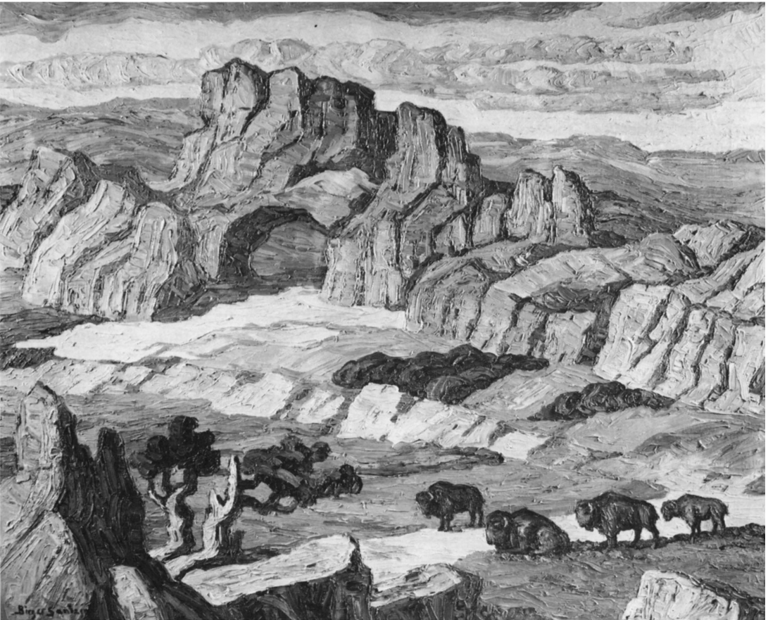
FIG. 6. The Arch . Oil on canvas, 48 x 61 inches, 1933. Birger Sandzén Memorial Gallery, Lindsborg, Kansas.