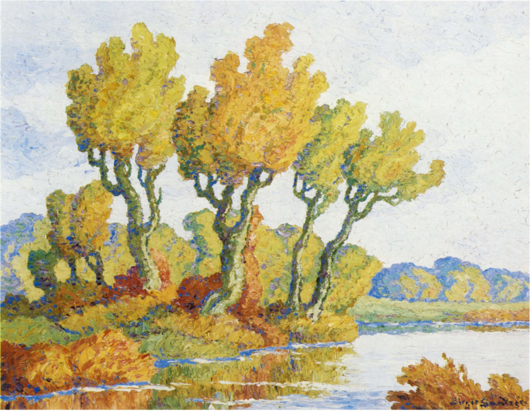
FIG. 4. Autumn, Smoky Hill River. Oil on canvas, 22 x 28 inches, 1942. Birger Sandzén Memorial Gallery, Lindsborg, Kansas.

which he so gladly chooses his motifs. The coloring which one always meets there is at the outset almost incomprehensible. The earth is so amazingly yellowish-red that it almost seems to be brighter than the sunlight. 19 In a 1931 interview with the Detroit News , Sandzén gave one of his strongest statements on the use of color: