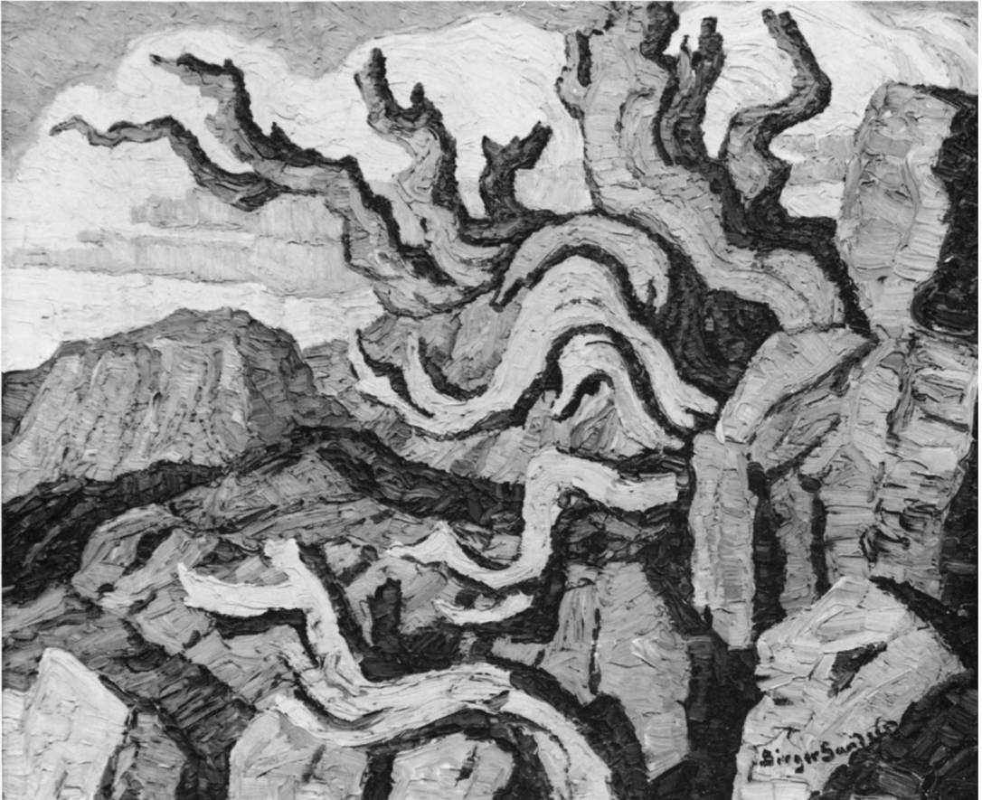
FIG. 5. Timberline Tree. Oil on canvas, 36 x 30 inches, 1930. Birger Sandzén Memorial Gallery, Lindsborg, Kansas.

his approach and attributed it to the quality of the landscape: