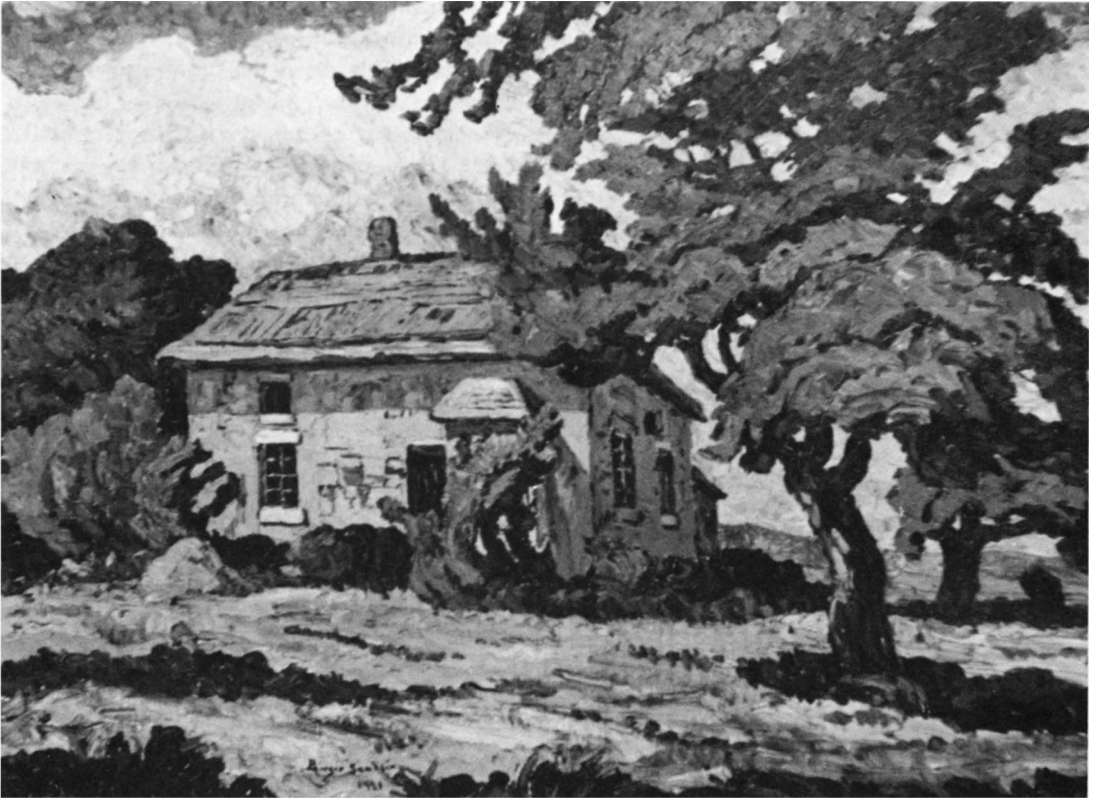
FIG. 2. The Old Homestead. Oil on canvas, 48 x 36 inches, 1921. Birger Sandzén Memorial Gallery, Lindsborg, Kansas.