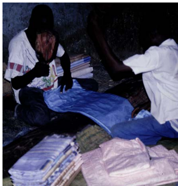
Fig. 3d. Men beating washed babban riga with mallets on wood log set in ground. Zaria City, Nigeria, July 1996.