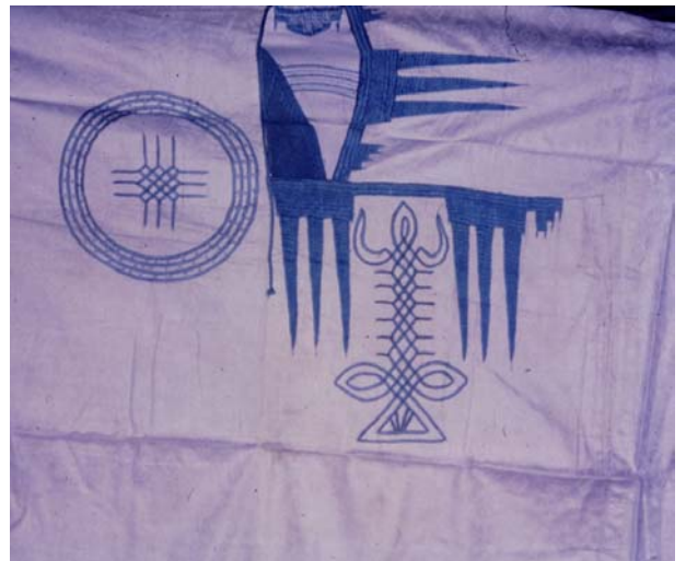
Fig. 4. Babban riga design style, ‘Yar Dikwa (“Daughter of Dikwa,” also known as ‘Yar Bornu (“Daughter of Bornu”); see Heathcote 1979:279) with reduced hand-embroidery. Zaria City, Nigeria, March 2001.