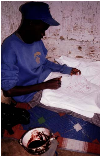
Fig. 3a. Young man drawing design on cut pieces of cotton damask, using sorghum stem pen and reddish ink, made from sorghum leaf-sheaths and potash (Heathcote 1979:168). Zaria City, Nigeria, December 1994.