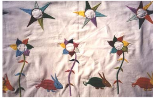
Fig. 5b. Hand-embroidered wall-hanging, using designs derived from women’s embroidered bedsheets, for Queen Amina Embroidery. Zaria City, Nigeria, August 2002.