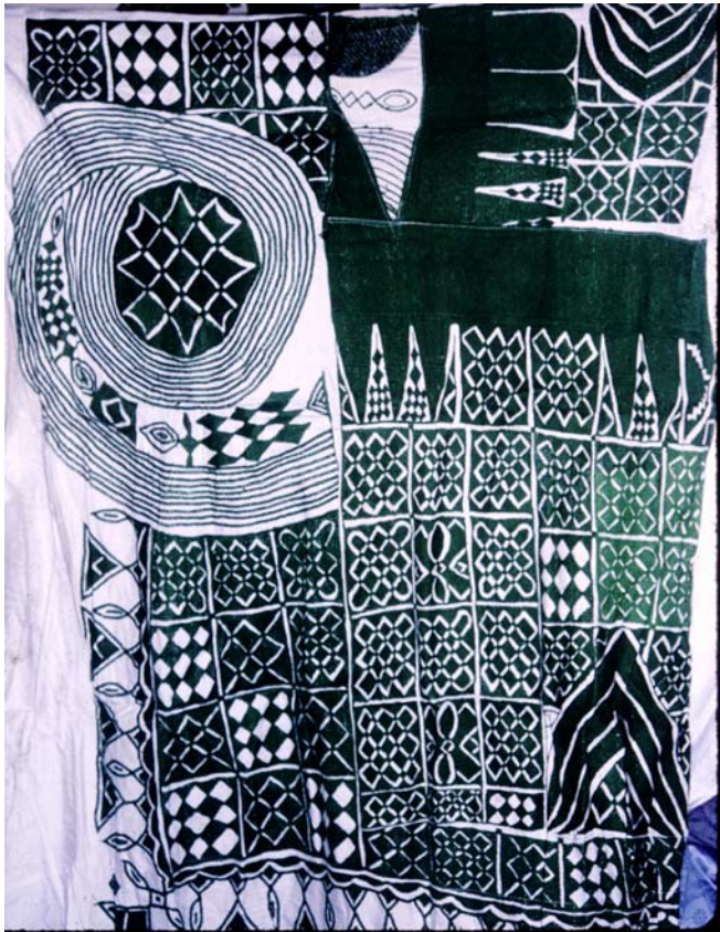
Fig. 1. Babban riga , aska takwas (eight knives) pattern; green cotton embroidery on white cotton damask. Cotton damask is