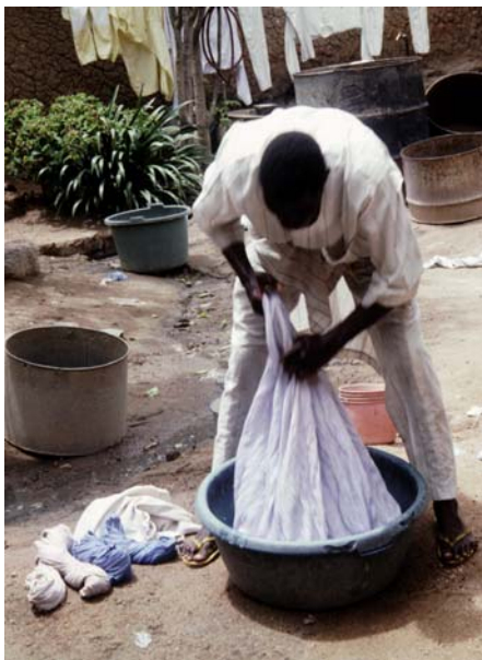
Fig. 3c. Man washing completed babban riga , before spreading them on the ground to dry. Zaria City, July 1996.