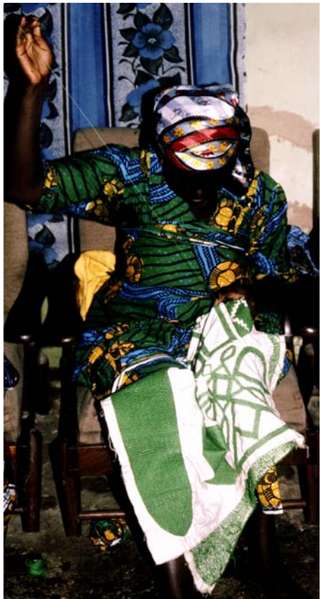
Fig. 2. Woman embroidering babban riga . Zaria City, Nigeria, November 1994.