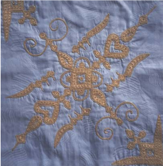
Fig. 5a. Hand-embroidered pillow cover, using design known as Bita da kallo (“Always looking”), derived from embroidered babban riga robes, for Queen Amina Embroidery. Zaria City, Nigeria, August 2002.