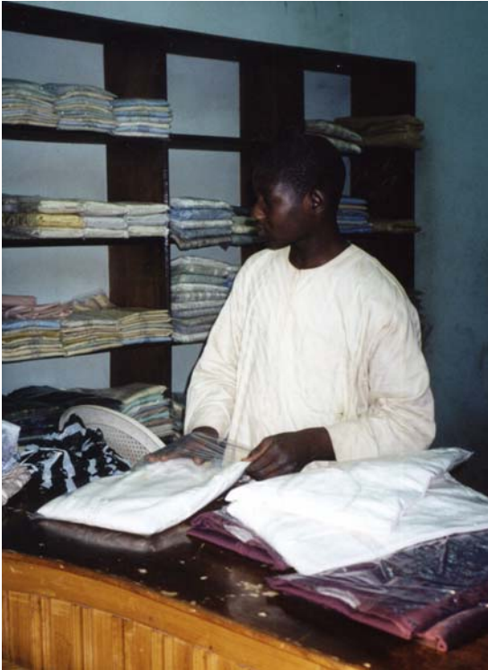
Fig. 3e. Man wrapping kaftans for sale in Zaria City shop. Zaria City, Nigeria, March 2001.