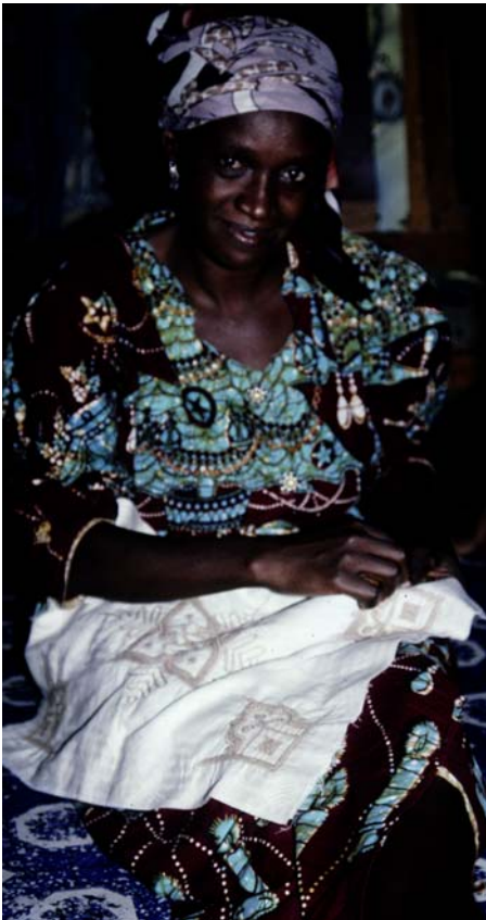
Fig. 6. Zaria City woman hand-embroidering pillow covers for sale through Queen Amina Embroidery. Zaria City, Nigeria, July 1997.