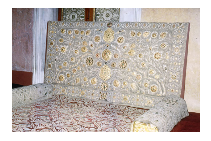
Figure 4 Imperial Jeweled Silk Throne Covers, Turkey, Istanbul, ca. 1600, silk embroidered with gems, pearls and gold, Topkapi Palace Museum.