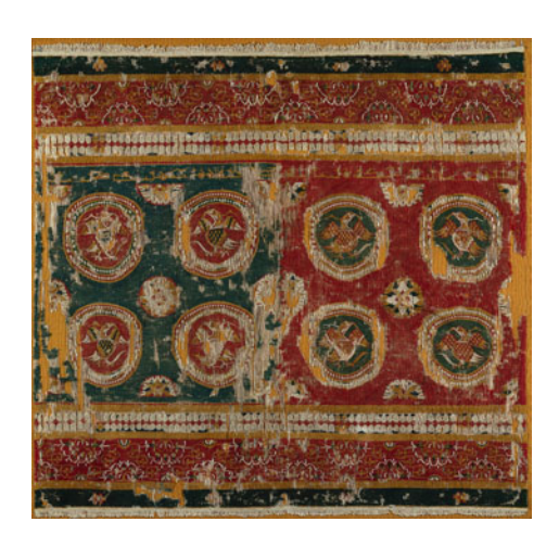
Figure 3 Wool and Linen Tiraz, Egypt, 9th c., tapestry, The Cleveland Museum of Art, Purchase from the J.H. Wade Fund, 1959.48.