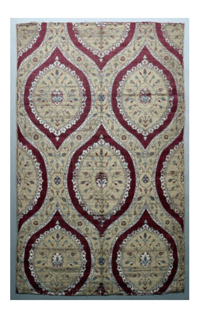
Figure 6 Silk Length, Turkey, Bursa or Istanbul, second half 16th c., "lampas," The Cleveland Museum of Art, J.H. Wade Fund, 1946.419