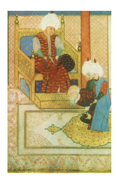
Figure 7 (above) Detail, Sultan Selim II Receives Ambassador on Jeweled Carpet, Account of the Seige of Szigetvar , Topkapi Palace Museum, H. 1339, fol. 178a, 1568-69. After N. Atasoy and F. Cagman, Turkish Miniature Painting , Istanbul, 1974, pl. 11.

Figure 8 (right) Jeweled Prayer Rug, Iran, Tabriz, ca. 1890, The White House, 907.471.1, Gift of H.H. Tapakyan.