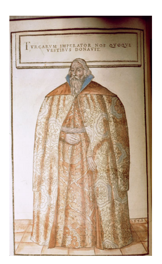
Figure 11 Ambassador Siegmund von Herberstein wearing Robes Presented by the Sultan in 1541, colored woodblock, Gratae posteritati Sigismundus liber Baro in Herbestein , Vienna, 1560, in Victoria and Albert Museum, 86.B.67.