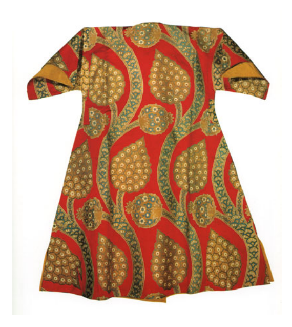
Figure 5 Silk Kaftan, Turkey, Bursa or Istanbul, late 16th c., "lampas," Topkapi Palace Museum, 13/584. After H. Tezcan and S. Delibas, The Topkapi Saray Museum, Costumes, Embroideries and other Textiles , trans. expanded and ed. by J.M.Rogers, Boston, 1986, pl. 38.