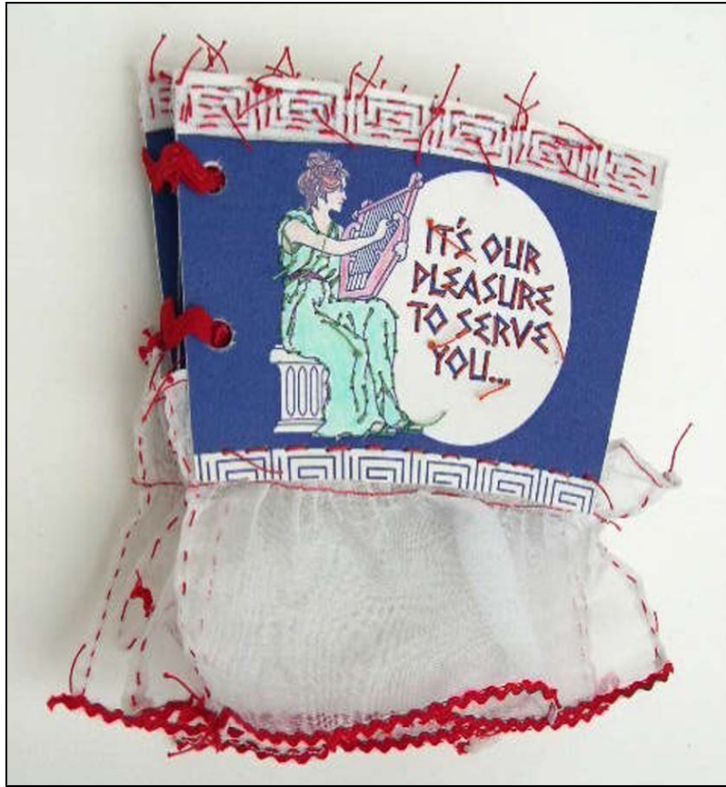
It's Our Pleasure to Serve You. 1997. Paper cups, thread, pencil, cloth.