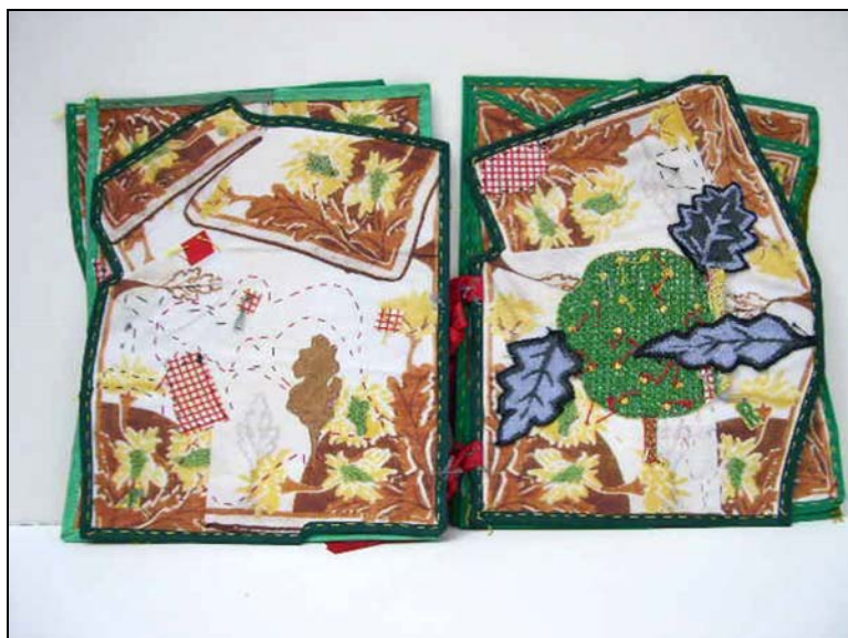
Digital Hankie. 2000. Paper, ribbon, thread, cloth, scanned images.