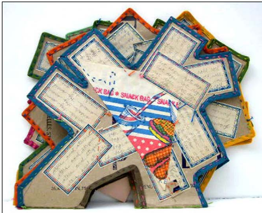
Fast Food. 1995. Paper, labels, pencil, seam binding, thread, empty French fry wrappers.