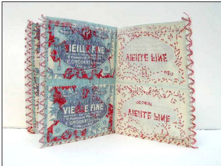
Vielle Fine. 1987. Belgian liquor labels, thread, mull.

Today these books remain remarkably playful and relevant.