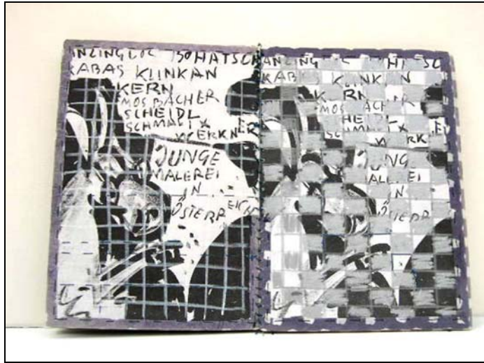
Gray Book. 1981. Postcards from Basel art fair, plastic, thread, pencil.