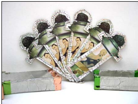
Gautier Fan (left). 1991. Tin, copper, paper, tape, cardboard.