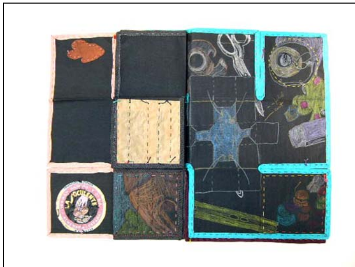
Mariage 1854. 1991. Cloth, found papers & objects, thread, paper.