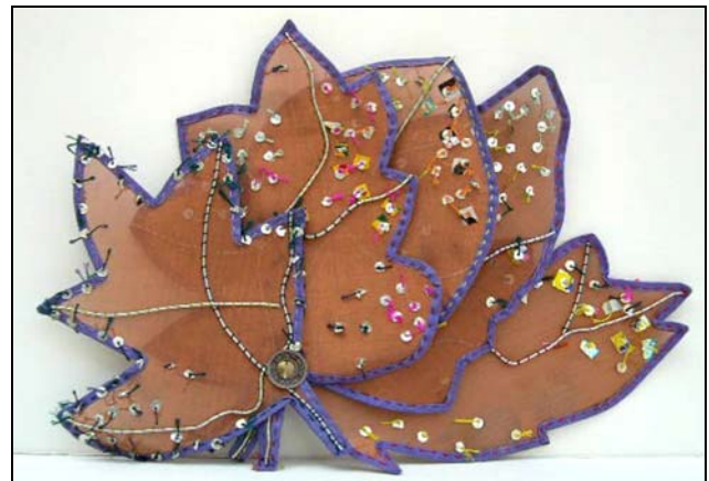
Leaf Fan Book (right). 1991. Metal, cloth, thread copper.