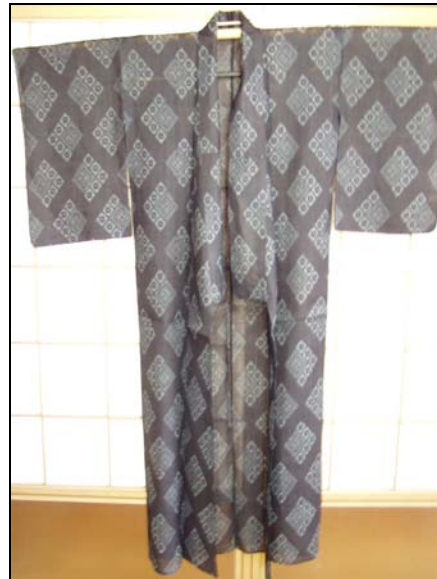
Figure 1. Kimono of Miyako-jofu (July 2005).

Miyako Island, located in the Sakishima Islands in Okinawa Prefecture, is known for the production of the Miyako-jofu textile. Miyako-jofu is a hand-woven ikat textile, which is dyed with indigo and woven with dye-resistant yarns of hand-spun ramie. (fig.1) “ Jofu ” means a ramie textile. In this paper, the dye-resistant process in which designs are reserved in warp or weft yarns by tying off small bundles is called “ ikat .”