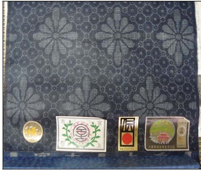
Figure 5. Miyako-jofu labeled by inspection of the association.

The manufacturing process of Miyako-jofu is as follows: (1) spinning yarns, (2) tying yarns according to the pattern, (3) dyeing, (4) weaving, and (5) washing and tapping the cloth. The manufacturing process of jofu follows the traditional way where each craftsman does each different process. Several months are necessary for one piece of jofu to be completed.