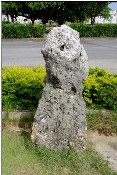
Figure 2. The pillar of the tax (Miyakojima City, August 2002).

already had the technique of weaving textiles of ramie, and indigo dyeing. And from the old songs of Ayagu in the sixteenth century, it is clear that the people in Miyako wove elaborate textiles and had purple and red dyeing [Inamura 1972:319-320]. The people in Miyako consider the origin of Miyako-jofu to be “ Ayasabi-fu ” (the ramie cloth of the striped pattern and of rusty color) which Toji Inaishi, a woman in Miyako wove. According to The Book of Eiga Family Tree , Shinei Shimoji Unpei who was Inaishi’s husband saved the ship which came back from Ryukyu from wrecking in 1583. Because his credit was admitted by the Ryukyu administration, Inaishi wove Ayasabi-fu and supplied it to Ryukyu to reward that obligation [Toyama Oono 1971:132]. However, before she made Ayasabi-fu , there had been ramie textiles in Miyako, and because of that, she can be thought of as having refined ramie textile.