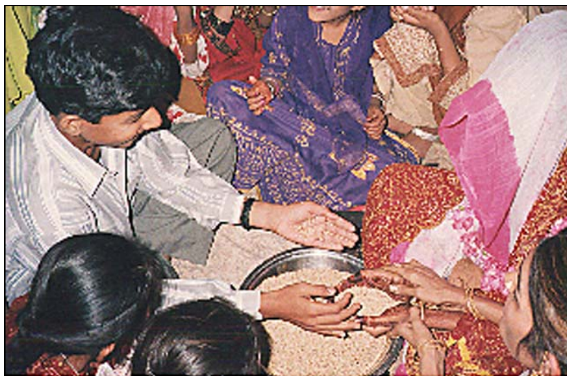
Figure 4. tel bharaien, sesame scooping played by Khatri bride and her in-law, 1998

After the marriage agreement is signed, the groom takes the bride to his house. In the groom's house, family members welcome the bride by playing a game known as tel bharaien , sesame scooping (fig. 4). The veiled bride scoops the sesame and hands it to her new family members, such as her mother-in-law, sisters-in-law and brothers-in-law.