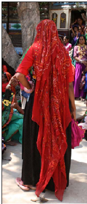
Figure 1. Woman wearing odhani, 2006, (c) Miwa Kanetani.

The odhani is a cover for the head commonly found in Gujarat, including Kutch. It is a piece of cloth two square meters in size made with a remarkable variety of materials, designs and colors which vary according to caste, age and locality. Odhnun means putting cloth on the head and odhani means cloth for putting on head in Kutchi. Traditional women's dress in Kutch is not the sari, but skirt, blouse and head cloth, odhani . The population in Kutch is comprised of 80 percent Hindu, 19 percent Muslim and 1 percent Jain. Hindu castes are called nat in Gujarati. The Muslims have mostly converted from Hinduism and also have caste like groups. Hindu, Muslim and Jain women each have specific dresses and odhanis . A tie-dyed odhani is necessary as a part of the wedding dress in every community, though it is referred to by a different name according to the community.