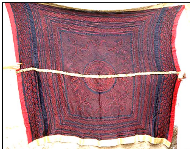
Figure 3. Tie-dyed wedding odhani , Candorokhani , 1998 (c) Miwa Kanetani.

Take Khatri wedding for example to show how the groom gifts a tie-dyed odhani to the bride, and how the bride uses it. Tie-dyed odhani has a different name in each community. Khatri or other Muslim communities call it khombi . Khatri has a special design for wedding odhani , called candorokhani (fig. 3), but other designs can also be used.