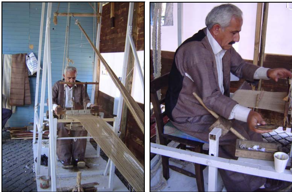
Figure 1 (left). Mohair cloth loom from Şırnak. The weaver is the Director of the Şırnak Community Development Bureau, which has organized a cooperative to promote the weaving of their traditional mohair cloth. This is a typical Anatolian textile loom, characterized by the wrap-around tensioning system.