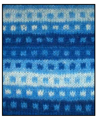
Figure 8 (left). Crochet scarf, korkje dyed wool. Figure 9 (right). Knitwear pattern, indigo on wool.