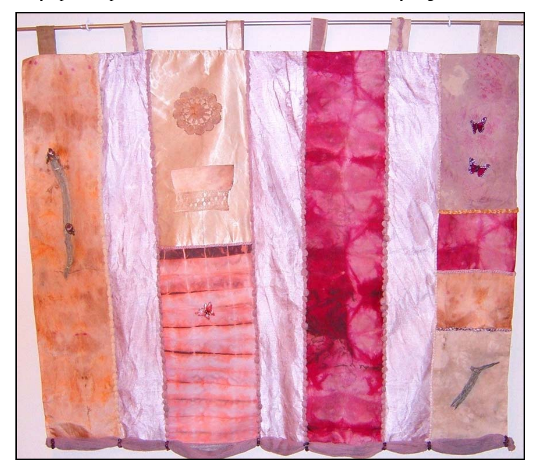
Figure 12. "Korkje stunt" (12) - a collage wall hanging, using the lichen Ochrolechia or "Korkje". Fabrics are cotton, silk, wool, polyester, polyamide. Size 40" x 50".

Karen has developed an adventurous and practical way to dye naturally using a zip lock bag instead of a pot. This means that we can do the dyeing everywhere and anytime and easily bring it with us, even on planes, as long as we take out the liquids So, we were taught non-traditional ways of dyeing, using alternative mordants like sugar and window cleaner, and using zip lock plastic bags. Even if I already had my own methods for unpredictable dyeing, the zip lock method really opened up new doors for me when it comes to "stunt dyeing".