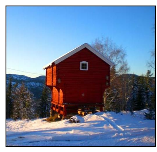
Figure 1 (left). Norway during summer time, Hardangervidda. Figure 2 (right). Winter time in Numedal. Typical pictures.

Despite the short summers, sources for all the rainbow colors can be found in nature. Plants, trees, bark, lichen, shrubs, mushrooms, seaweed and even purple snails (Nucella lapillus), are something the old Norsemen and women were aware of and used, not only on their home made textiles, but also as trading commodities. Sheep wool, linen, hemp and nettle were the most common fibers and from trading trips abroad (some would probably call these trips with different names) the Norwegians developed a taste for silk fabrics as well. The silk was, of course, used by the wealthiest only.