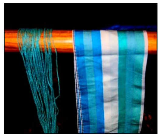
Figure 3. Woad grown in Norway (3). The color is more yellow than indigo. Photography by Emily Halvorsen, Norway 2007.

Trading with other people, imported dyes like indigo and cochineal were introduced, but this was not an immediate success. Norwegians loved their local blue dyes made from the woad plant, which gave a yellower blue than the indigo or lichen. For some time the daring risked being killed if they were discovered using the foreign indigo blue. The risk was probably taken as a matter of taste for the color, but the regulation was probably a way to protect the domestic woad production.