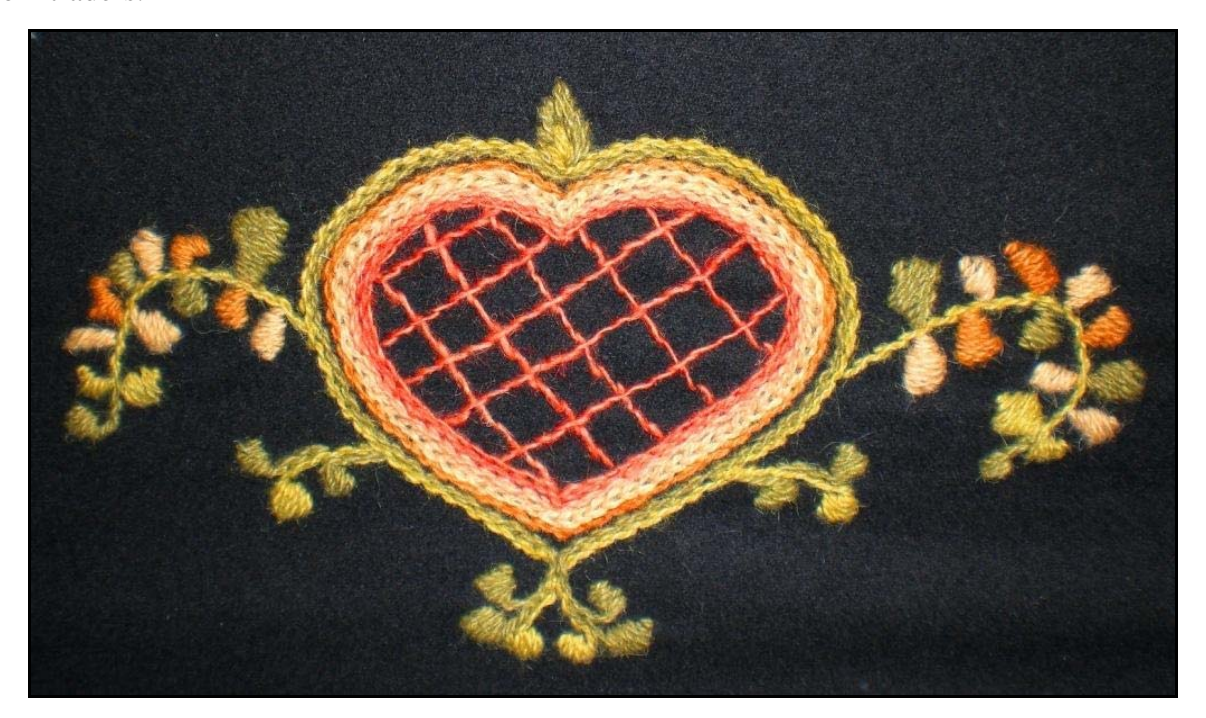
Figure 4. Traditional embroidery, wool on wool, dyes from madder, lichen Parmelia saxatilis, St. John's wort.

All textile work has always been considered woman's work in Norway, and the women would do the work at home. Norway didn't have the guilds which were common in the rest of Europe, at least not for what was considered women's work. And the guilds that existed came much later to Norway than to other European countries. For years, the few wealthy Norwegians would send their clothes to Europe to have them professionally dyed, or they bought dyed cloth abroad or from traders.