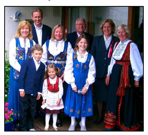
Figure 5. Norwegian folk costumes. Typical family photo, 3 different folk costumes representing 3 different regions in Norway; Vestfold, Gudbrandsdalen, Telemark.

In the 1970's, Norwegians voted not to become a member of the European Union and the folk costume was found again, and worn on special occasions.