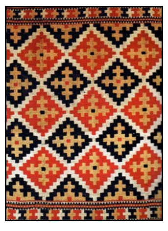
Figure 6 (left). Traditional pullover, wool dyed with St. John's wort and lichen Parmelia saxatilis. Figure 7 (right). Coverlet in traditional pattern, wool dyed with madder root and birch leaves.

Fashion and textile designers have for decades had a challenging job in Norway, with few exceptions. Norway has not delivered much fashion to the world either. The only item we may be known for is our knitted wool sweater in different traditional patterns. NICEF, Norwegian Initiative for Clean & Ethical Fashion, promoting environmentally friendly and ethical fashion made by Norwegian designers, was introduced at the Oslo Fashion Week in 2007. There is hope that some of the initiatives presented by NICEF, including the use of natural dye extracts, will be recognized one day.