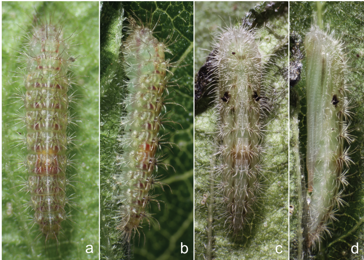
Figure 6. Larva and pupa of Adaina perplexus : a) larva (prepupa), dorsal view; b) larva (prepupa) lateral view; c) pupa, dorsal view; d) pupa, lateral view.

Comments. While A. ambrosiae has not been recorded from the Bahamas, it occurs in Florida, the Dominican Republic, and elsewhere in the West Indies, thus making it necessary to check the genitalia of suspected A. perplexus specimens for positive identification. As more material becomes available and larvae and pupae can be preserved, descriptions and additional characters may help distinguish the immatures of the two species.