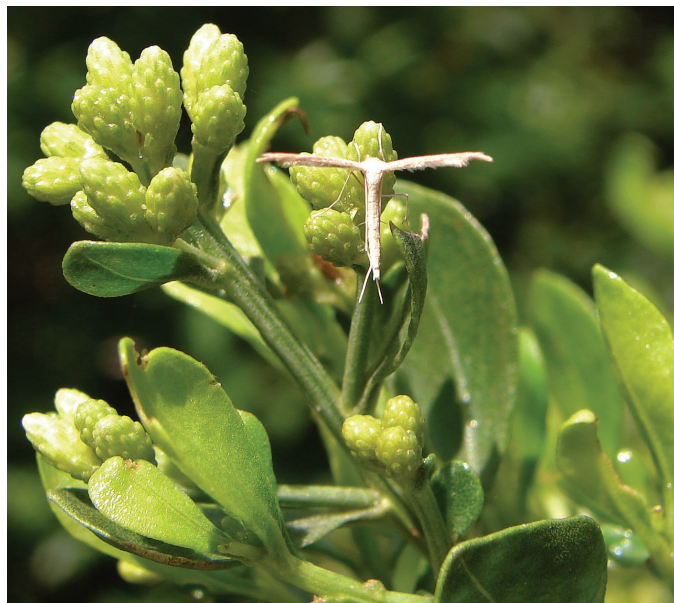
Figure 1. Lioptilodes albistriolatus adult resting on larval host plant, Baccharis halimifolia .

the costa near the cleft base. The anal fringes of the hindwing third lobe also bear a distinct dark scale tuft. Males of this species are distinguishable from Stenoptilodes taprobanes (Felder and Rogenhoffer) by genitalia only. The aedeagus and uncus are both slender and proportionally longer in S. brevipennis compared to S. taprobanes . Females can be easily distinguished from S. taprobanes by external characters, in this case the presence of a pair of distinct dark scale tufts on the ventral surface, flanking the ostium.