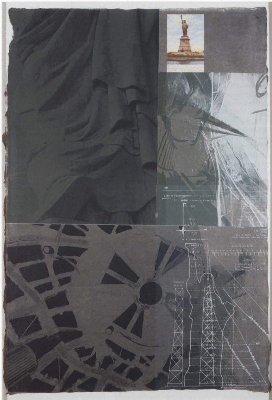
Untitled (Statue of Liberty) , 1983, UNL-F.M. Hall Collection