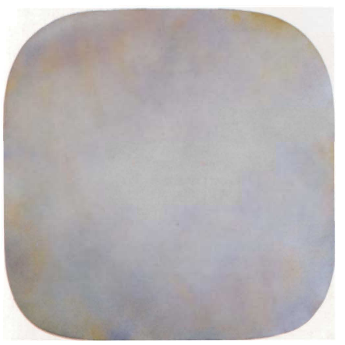
LILEM I, 1974, acrylic on canvas, 60 1/2 x 60 1/2 in.

In the intervening years Haerer had produced series of dark paintings and drawings which she described as "the subterranean side of the white paintings. They speak of deep forces under the earth that rumble, expand, and push, of the earth's energy which causes great forests to grow and lava to burst forth." These images draw their inspiration from sources as diverse as the late, dark paintings of Goya, another of the objects of her admiration, and memories of blackened lava fields in Hawaii. In these works,