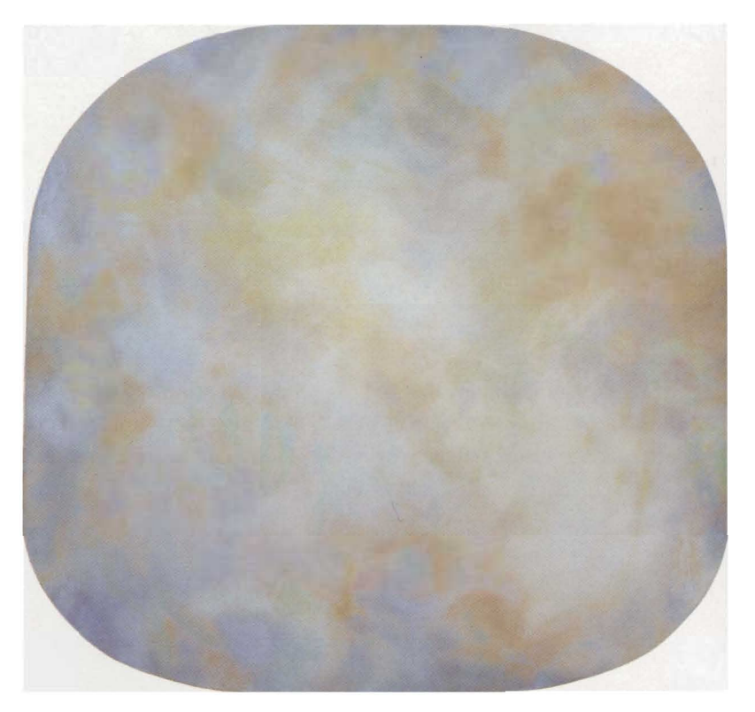
LILITH, 1973, acrylic on canvas, 97 x 101 in.