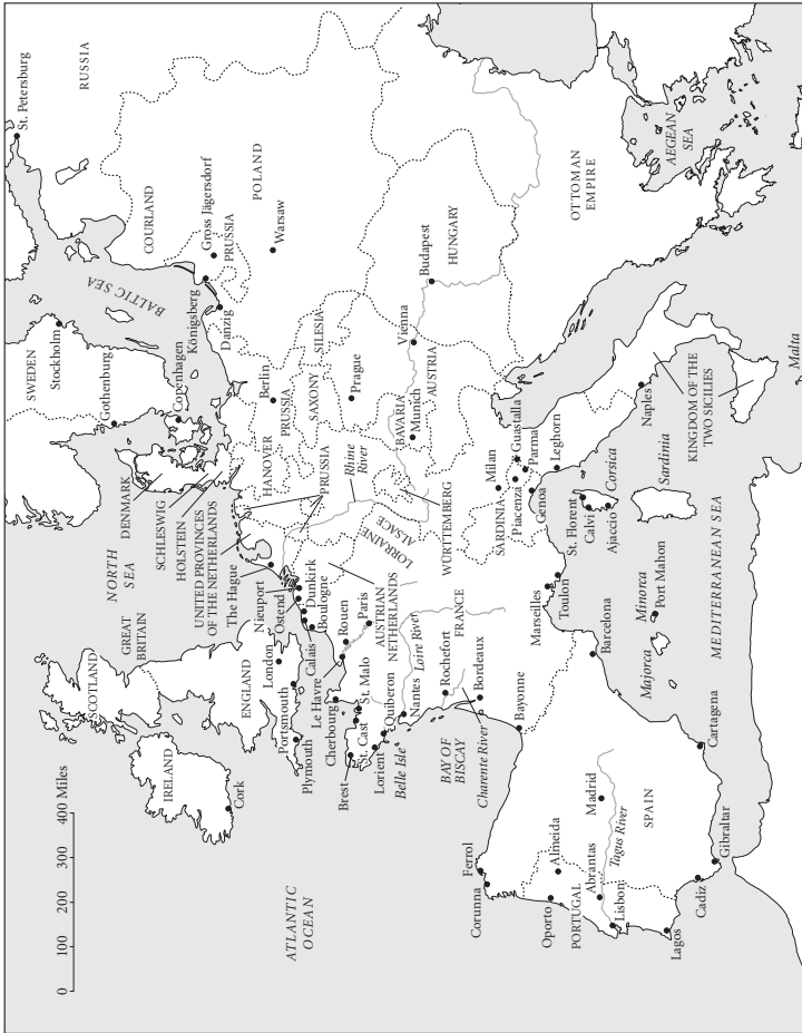
MAP 1. Europe in 1750

From Dull, The French Navy and the Seven Years' War (Nebraska, 2005).