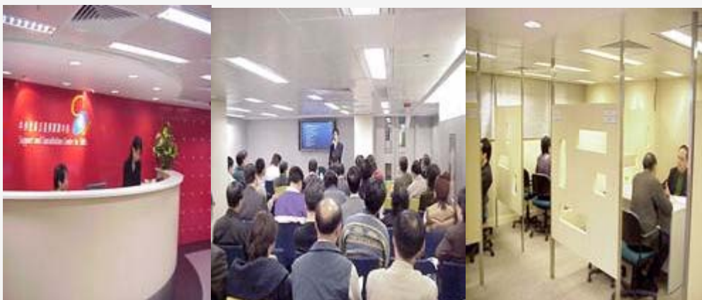
Figure 2: Set-up for Business Information provision and consultation

A set-up of SUCCESS with daily transactions taking place is shown in Figure2.