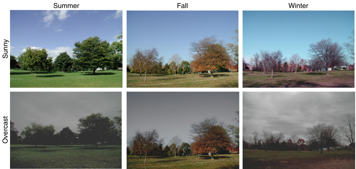
Fig. 1. Example of a stimulus scene captured under each of the two light intensity (overcast, sunny) and each of the three season (summer, fall, winter) conditions.

feeling if they were in the scene. Participants completed the POMS Depression–Dejection Subscale after baseline and after each stimulus block.