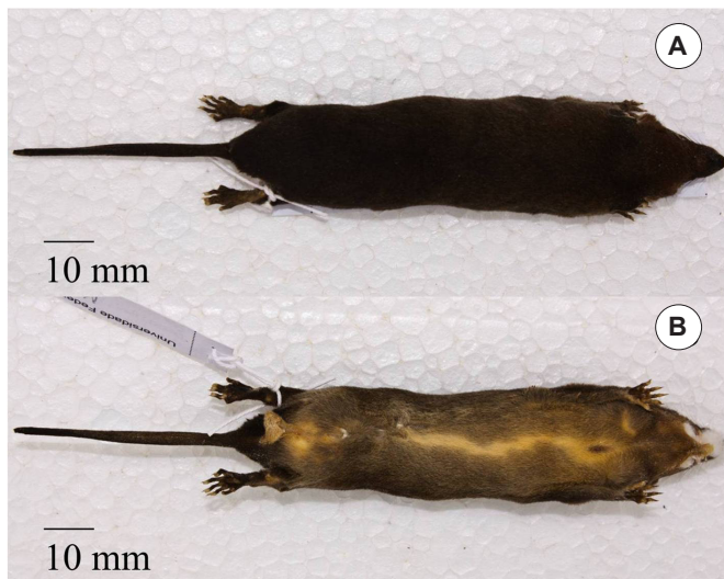
FIGURE 2. Dorsal (A) and ventral (B) views of a stuffed skin of M. kunsii (Specimen: MN 73872 [FMH-127], Sex: male, Age class: P 3/3 M 4/4) captured in the National Forest of the Serra dos Carajás, PA.

width, but clearly present in all three specimens); throat-gland present in males. Skull with postorbital processes and sagittal crest absent; paraoccipital processes well-developed, but not persisting to dorsal midline; both lacrimal foramina present and clearly outside orbit; upper first pair of incisors smaller than posterior incisors. External measurements and weight of the two adult male voucher specimens (MN73872, MN74002) are given in appendix 2. Solari (2010) and Carvalho et al. (2011) have presented evidence of a genetic divergence between specimens from southern Bolivia/ northern Argentina/ eastern Paraguay, and specimens from the Cerrado of central Brazil. Although we are referring these specimens to M. kunsii , based on the morphological characters cited above, our specimens are larger than those specimens reported from the Andean dry forests, Chaco and Cerrado habitats, and we believe that further studies and the survey of more specimens may reveal that M. kunsii is a species complex, and that our Monodelphis specimens from the Carajás National Forest represent an undescribed species related to this taxon.