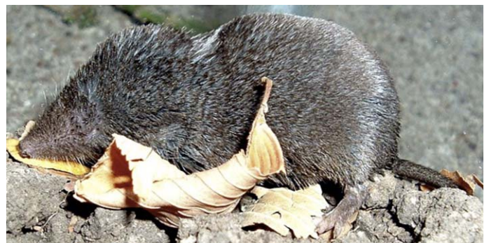
Fig. 1. —An adult male Blarina hylophaga from Kansas: Ellis Co.; 9¼ mi. N, ¾ mi. W Hays, T12S, R19W, E center sec. 14; 39.01055°N, 99.39038°W.

NOMENCLATURE NOTES. Until recently, B. hylophaga was listed as a subspecies of B. brevicauda and subsequently B. carolinensis (Blair 1939; Elliot 1899, 1905; Genoways and Choate 1972; George et al. 1981; Schmidly and Brown 1979). Therefore, an extensive literature search was conducted to find current citations of the name B. hylophaga and the