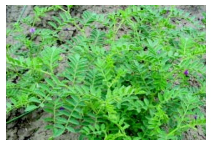
Figure 1. Fern leaf structure of chickpea.

Chickpea is an annual cool-season plant that ranges in height from one to three feet. It has an indeterminate and branched growth habit, erect or spreading, with hairy leaves, stems, and seed pods that secrete highly acidic exudates. It typically has a bluish green or dark green color, but some types are olive in appearance. Most chickpea have a fern leaf structure comprised of several pairs of small rounded or oblong leaflets ( Figure 1 ). Some kabuli-