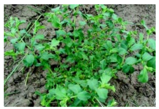
Figure 2. Unifoliate leaf structure of chickpea.