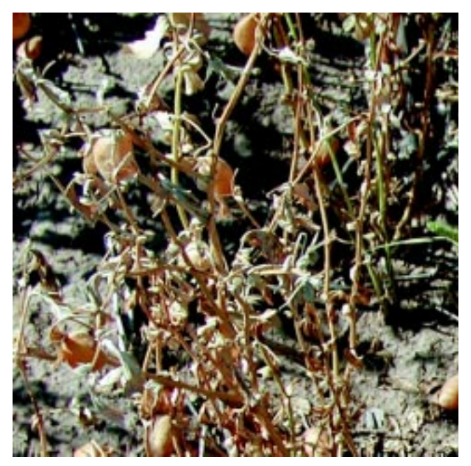
Figure 5. Mature chickpea plants.

Continuous monitoring for cracked seed and damaged seed coats is necessary to ensure that the combine is