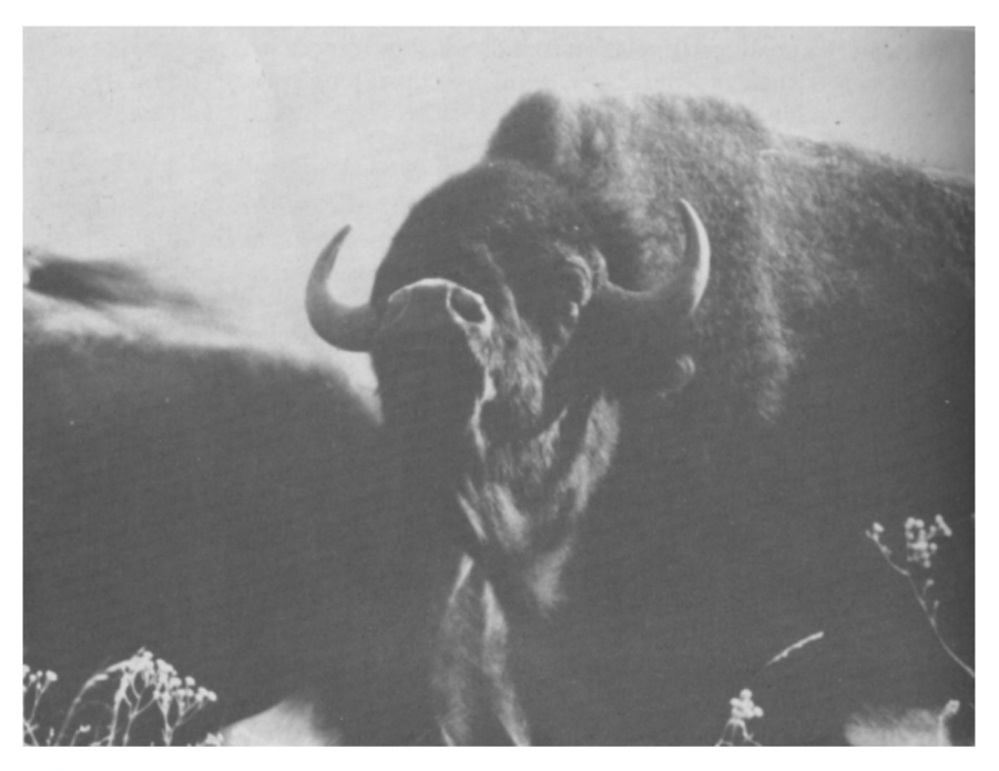
FIGURE 1. Young bull exhibiting Flehmen.

Secondary objectives were to determine if lip curl duration was environmentally affected and if a relationship existed between the lip curl direction and wind direction. Side to side head movements during Flehmen and descriptions of simultaneous inhaling give credence to the hypotheses that the display may be affected by external factors and a lip curling animal may orient its body or open mouth in relation to the wind direction.