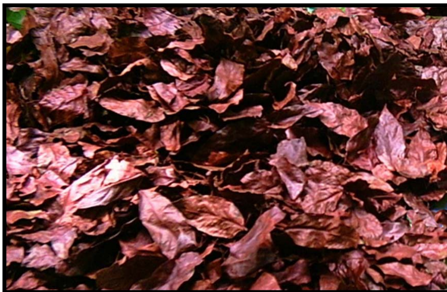
Figure 4. “ Arrabidaea chica .” Colombia.

Investigation and analysis by HPLC-PDA carried on by Devia 14 et al. on textiles from the tenth to the sixteenth centuries, belonging to Muisca, Guane and U’wa civilisations from Colombia, revealed the recurrent presence of this red dye in textiles of the area. The main dye constituent of Arrabidaea , carajurin, was established by Chapman et al. in 1927, for which they proposed a 3-desoxyanthocyanidin structure. Recent research by Devia et al. has confirmed the structure proposed by Chapman for carajurin, and have isolated and determined the structure of two new 3-desoxyanthocyanidins from the leaves, all of which produce fairly stable red dyes 15 .