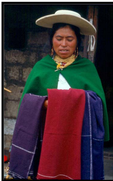
Figure 2. Salasaca dyer showing red woollen cloths with modified cochineal red colours. Ecuador.

vara y media in reference to the length of the cloth 6 . It was traditionally dyed with cochineal 7 but each woman would choose a different shade of red.