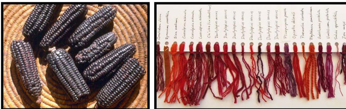
Figure 8 (left). Purple corn, “ Zea mays .” Peru. Photo: A. Roquero. Figure 9 (right). Reference samples of dyes mentioned in this paper. Photo: A. Roquero.