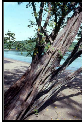
Figure 5. “ Haematoxylon brasiletto .” Costa Rica.