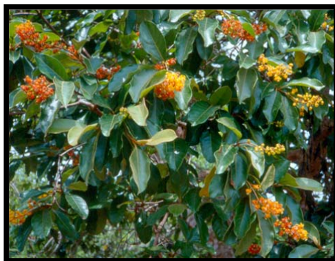
Figure 7. " Byrsonima crassifolia ." El Salvador.

The bark of indano contains condensed tannins that are transformed by oxidation into strong russet dyes of the phlobaphene type. The same kind of tannins and other pigments of the anthracenic group, like emodin, are also present in the bark of alder trees ( Alnus spp.) 21 . The use of alder bark to obtain a rusty red colour is common in Central and South America. The same type of bright orange-red, tannin dyes, developed by oxidation on cotton cloth, are still achieved, by Shippibo dyers in the Peruvian Amazon using mahogany bark ( Swietenia macrophylla ) and by dyers living near mangrove swamps with mangrove ( Rhizophora mangle ) root barks 22 . Although this type of dyes is especially suitable for cotton, the author has found dyers in Cuzco and in the Parobamba region in Peru using them for wool and alpaca.