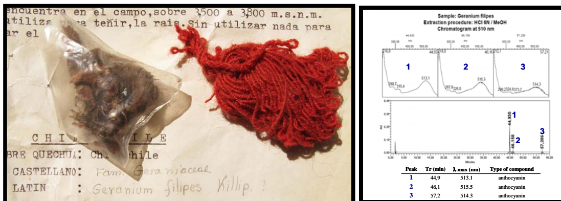
Figure 10 (left). “ Geranium filipes ” sample. Figure 11 (right). Chromatogram at 510 nm of fiber sample dyed with “ Geranium filipes ” obtained by HPLC-PDA.

Three compounds were detected as main components in the Geranium filipes sample. As shown in Figure 10, the UV-visible absorption properties ( \lambda_{max} ) are similar for the three and typical for anthocyanin dyes.