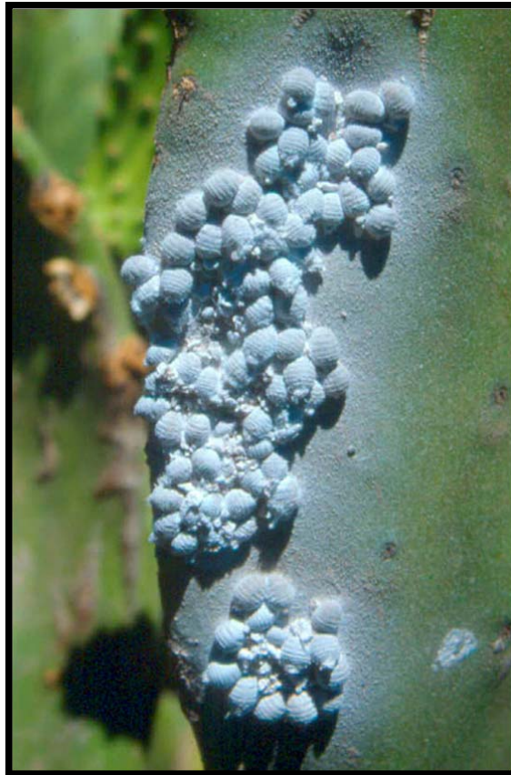
Figure 1. Cochineal (Dactylopius coccus), Mexico.

food: ...we order that in the entire kingdom there must be food in abundance... and magno... and other kinds of leaves to dye colours for cumbi... 4 .