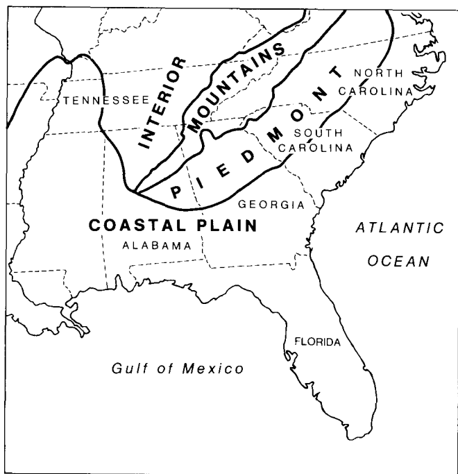
Figure. Major physiographic regions of the southeastern United States.

b References: (1) Bode 1983; (2) Boesel and Winner 1980; (3) Caldwell 1984; (4) Caldwell 1985; (5) Caldwell 1986; (6) Coffman et al. 1986; (7) Coffman and Roback 1984; (8) Cranston and Oliver 1988a; (9) Cranston et al. 1983; (10) Cranston and Saether 1986; (11) Ferrington 1984; (12) Ferrington and Saether 1987; (13) Halvorsen 1982; (14) Halvorsen and Saether 1987; (15) LeSage and Harrison 1980; (16) Oliver 1981; (17) Oliver 1985; (18) Oliver and Bode 1985; (19) Oliver and Roussel 1983; (20) Rempel 1937; (21) Saether 1969; (22) Saether 1975a; (23) Saether 1976; (24) Saether 1977b; (25) Saether 1981a; (26) Saether 1981b; (27) Saether 1982; (28) Saether 1983a; (29) Saether 1984; (30) Saether 1985a; (31) Saether 1985b; (32) Saether 1985c; (33) Saether 1985d; (34) Saether 1985f; (35) Saether 1985h; (36) Saether 1989; (37) Saether 1990; (38) Saether and Halvorsen 1981; (39) Saether and Sublette 1983; (40) Saponis 1977; (41) Saponis 1979; (42) Wirth 1952.