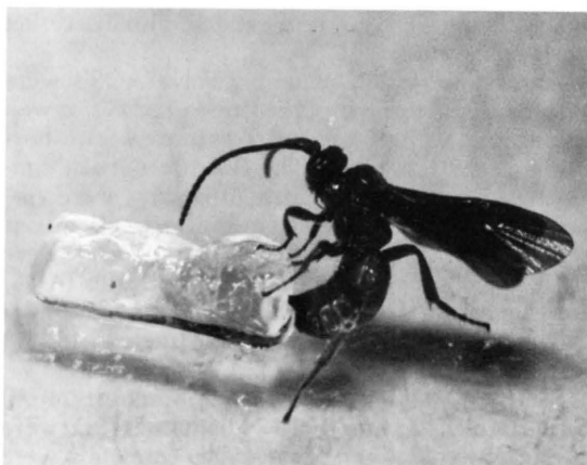
Fig. 1. Photograph of Microplitis croceipes ovipositing into an agarose "larva." The "larva" consists of a 20- \mu l, 0.75% agar cylinder soaked in host hemolymph for 20 min.

distilled water. In a third test, five AOS's were treated with fifth-instar host hemolymph after parasitoid emergence, five AOS's with equal parts of 0.5 M trehalose plus postemergence hemolymph, and five AOS's with 0.5 M trehalose alone.