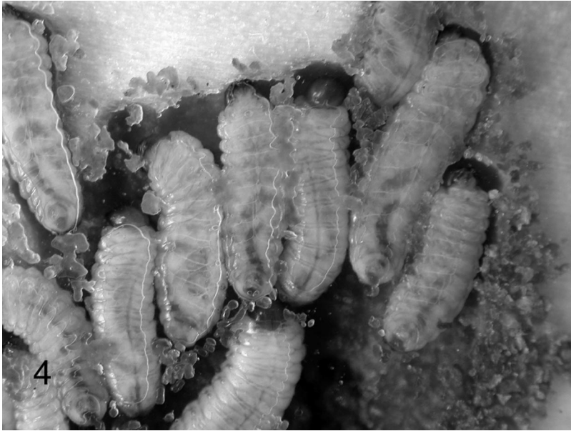
Fig. 4. After hatching, larvae of D. murrayanae congregate in the phloem and feed side-by-side, creating a brood chamber that extends from their parental egg gallery. These third-instar larvae were photographed in the laboratory through glass enclosing phloem into which they were inserted soon after hatching from eggs in the field.

ground; none occurred above 20 cm. Galleries were sealed by a relatively large pitch mass extruded from the entrance. The pitch crystallized in time, shedding bleached granules on the ground beneath the entrances, much like D. punctatus (Furniss 1995).