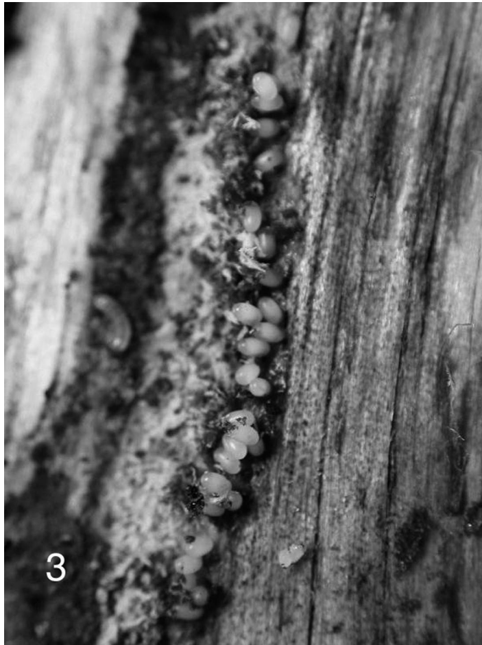
Fig. 3. Eggs are laid in a strung-out mass at a widened place along one side of the egg gallery.